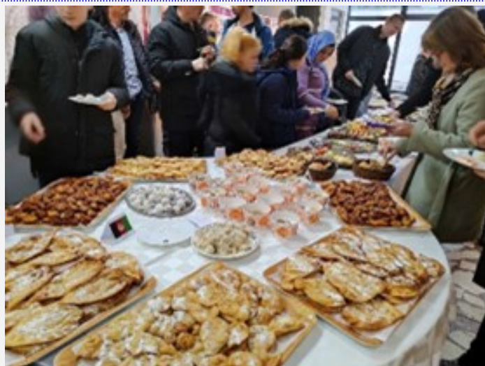
MARKING THE CITY OF BIHAĆ'S 762TH ANNIVERSARY

They gladly accepted the invitation and prepared a range of dishes and sweets typical of their national cuisines, to thank the city for its hospitality. Guests at the event had a chance to taste delicious Mamool, a Syrian dish, along with Zardeh, or Gosh-e-fill , which means "sweet ear" in Dari. Guests from Afghanistan advised Bosnians to drink more tea than coffee, while Indian migrants, who prepared Gulab Jamun, noted that more vegetables would not hurt. With a heavy heart, Bosnians agreed that Syrian baklava was better.