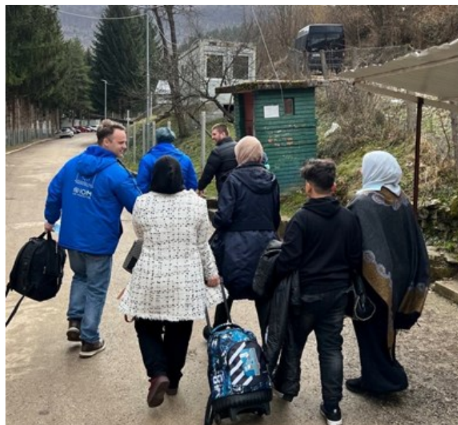
TRC UŠIVAK STAFF ASSISTING A NEWLY ARRIVED FAMILY

# of protection/MHPSS services provided by IOM: 2,309