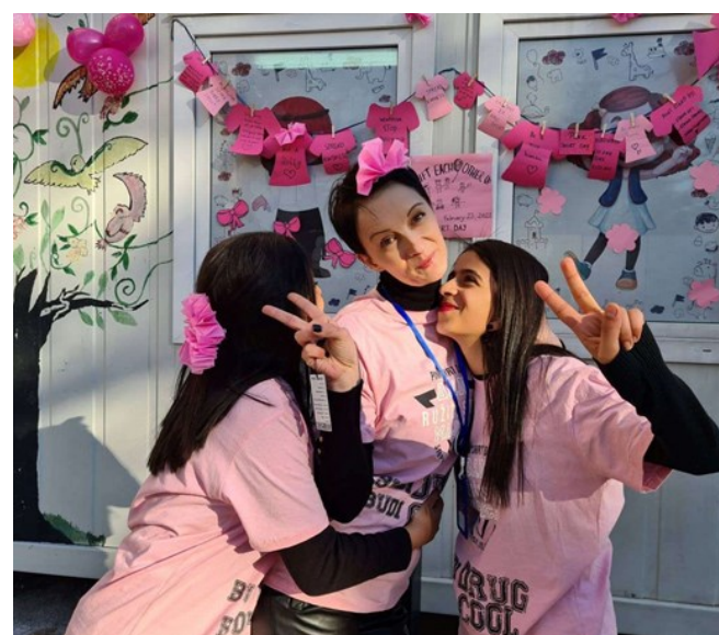
PINK T-SHIRT DAY IN TRC BORIĆI