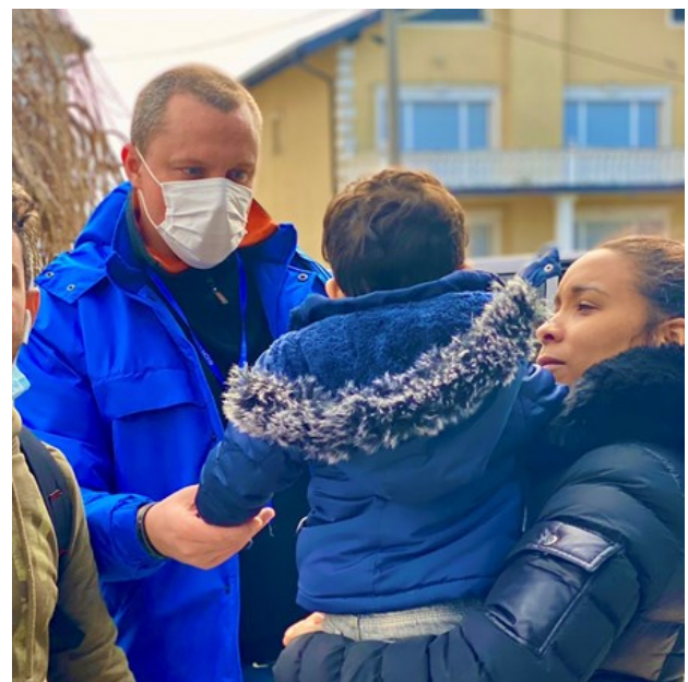
10TH DTM EXERCISE ORGANIZED ON 23 FEBRUARY

On 26 February, migrants accommodated in TRC Borić joined the celebrations marking the 762 nd anniversary of the City of Bihac at the local Cultural Centre. Beneficiaries represented their countries, including Afghanistan, Jordan, Iran, Syria and India, through national cuisine and desserts they prepared especially for this occasion. The event, which was attended by city authorities, cantonal representatives and many Bihac citizens, provided a unique opportunity for community engagement and many participants stated that similar initiatives should be organised more often.