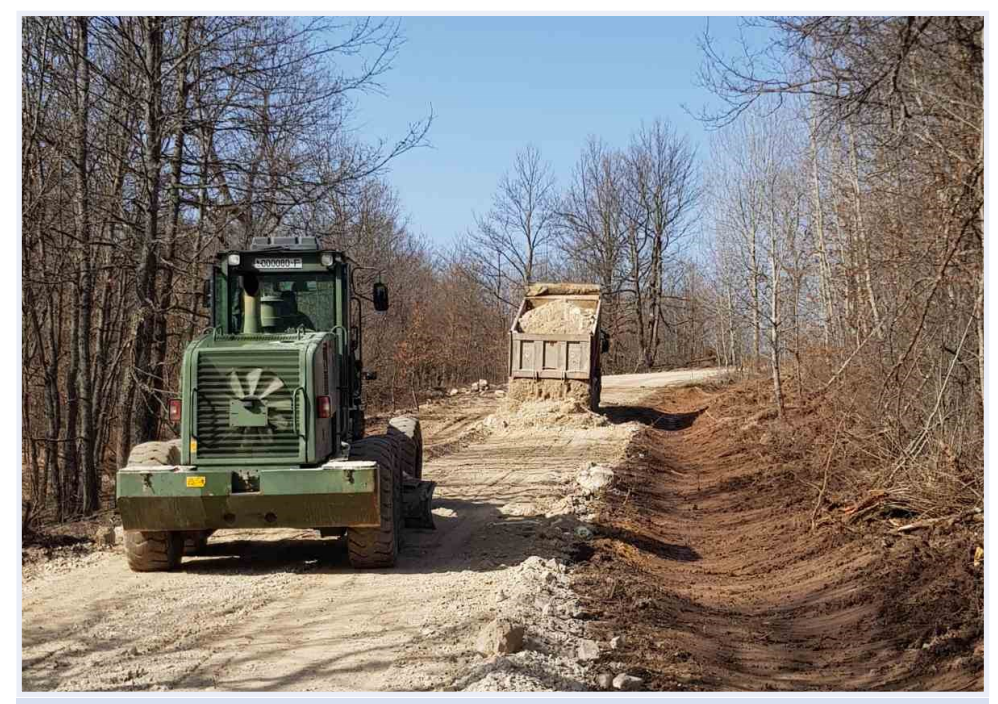
Road works to PC Lipa