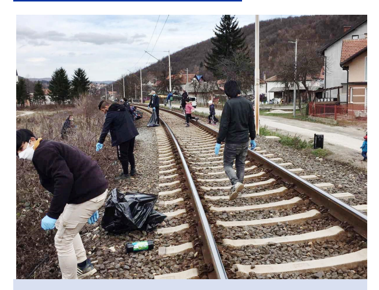
Migrants from Usivak and IOM staff help clean the environment