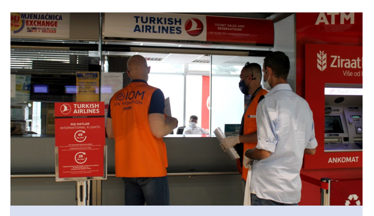
Assisted voluntary return of migrants from BiH

# of food packages distributed: 1,973 # of Hygiene items and NFIs distributed: 20