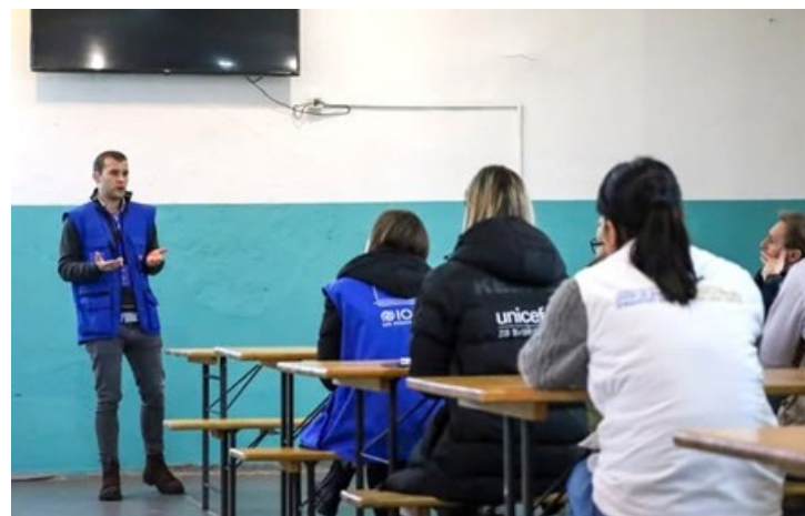
PSEA TRAINING FOR ORGANIZATIONS AND INSTITUTIONS PROVIDING SERVICES IN TRC BORIĆI. ©IOM 2024

# of beneficiaries reached with info sessions: 755