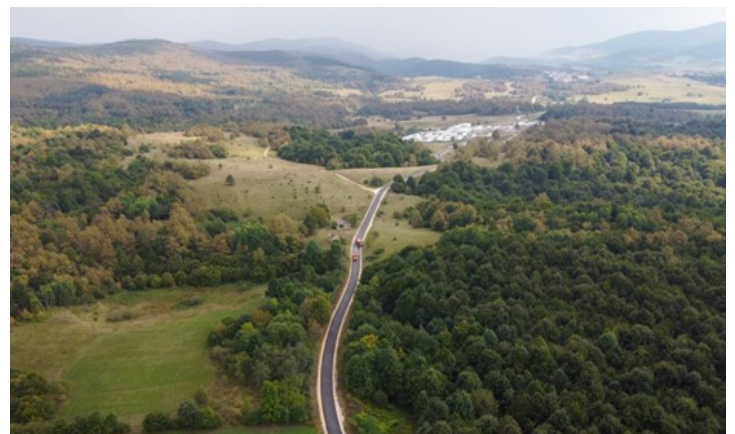
THE EU FUNDED THE NEW ASPHALT ACCESS ROAD TO TRC LIPA.

On 3 December, the newly asphalted access road to TRC Lipa was officially opened. Funded by the European Union, the road represents a key infrastructure improvement that creates a sustainable and positive impact for both migrants and the local community by supporting efficient emergency transport, timely delivery of supplies, development of businesses and local economic growth.