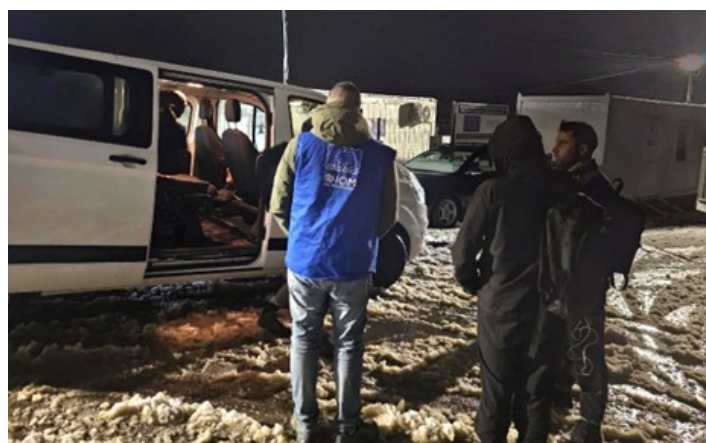
IOM MOBILE TEAMS PROVIDE TRANSPORTATION TO MIGRANTS IN VULNERABLE SITUATIONS.

# Assisted Voluntary Returns since 2018: 1,560 M: 1,376 F: 184