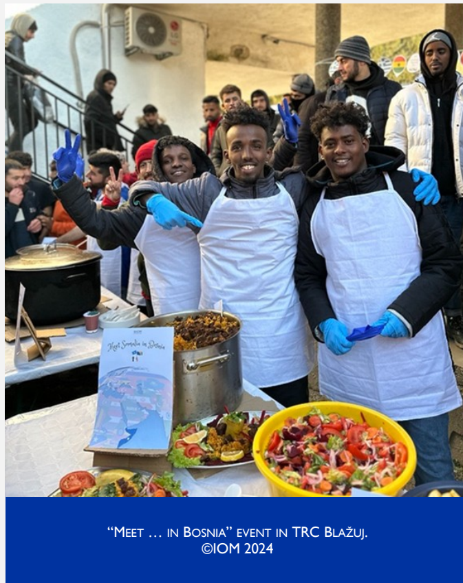
"MEET ... IN BOSNIA" EVENT IN TRC BLAŽUJ.

These stories are testaments of shared humanity, hope and love.