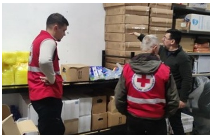
RED CROSS TEAMS WORKING WITH IOM ON REORGANIZATION OF THE NFI WAREHOUSE IN TRC BLAŽUJ.

In TRC Lipa, IOM presented the quarterly operational plans to the Red Cross of Una Sana Canton and the SFA. These plans detail daily activities across Food, Non-Food Items (NFI), Shelter, and Water, Sanitation, and Hygiene (WASH) services. The presentation aimed to ensure well-coordinated implementation of daily activities, promoting better organization, communication, and adherence to Standard Operating Procedures across all teams.