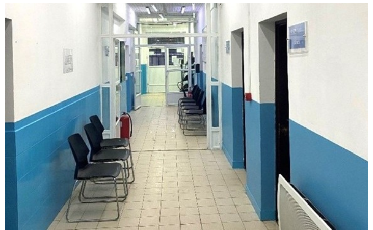
MEDICAL SCREENINGS AND CONSULTATIONS UNDER ONE ROOF IN TRC UŠIVAK.

ensure a smoother workflow for medical screenings and other health-related services.