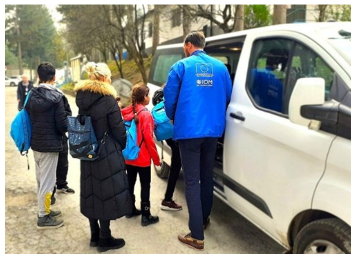
IOM MOBILE TEAMS PROVIDE TRANSPORTATION FOR SCHOOL CHILDREN.

# Assisted Voluntary Returns since 2018: 1,557 M: 1,374 F: 183