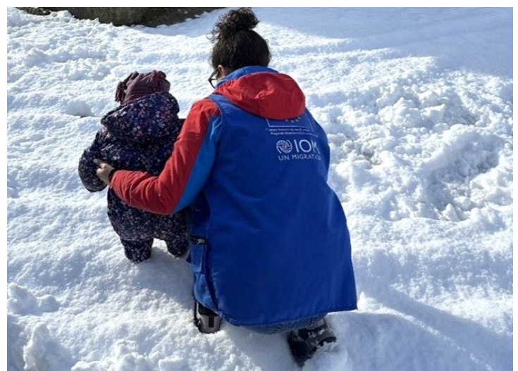
WINTER FUN IN TRC UŠIVAK.

IOM organizes various activities and sessions with beneficiaries to promote community involvement and increase awareness in all reception centres on a variety of topics. During the reporting period, a total of 12 community events were organized across four reception centres (4 sessions on the prevention of sexual exploitation and abuse, 2 creative and art sessions, 2 legal/info sessions, 2 sessions on mine risk education, 1 session with a focus on mental health, and 1 sport and play) for a total of 97 participants (81 M, 16 W).