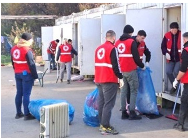
RED CROSS TEAM PREPARING ACCOMMODATION UNITS FOR NEW BENEFICIARIES IN TRC BLAŽUJ.

# of beneficiaries reached with info sessions: 780