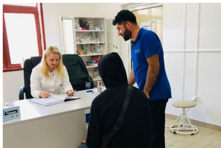
ENTRY MEDICAL SCREENING PERFORMED BY THE SARAJEVO CANTON PUBLIC HEALTH INSTITUTE IN TRC BLAŽUJ.

IOM staff provided support to the Una Sana Canton and Sarajevo Canton Red Cross teams in TRC Blažuj and TRC Lipa in the Water, Sanitation and Hygiene (WASH) sector. Their work included managing the laundry facility, maintaining accurate records, monitoring overall cleanliness, and ensuring the completion of tasks from previous shifts. IOM will continue regular communication and provide ongoing assistance to enable Red Cross staff to independently deliver WASH services within the centres.