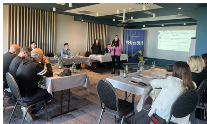
IOM ORGANIZED THE RETURN COUNSELLING TOOLKIT TRAINING FOR THE SERVICE FOR FOREIGNERS' AFFAIRS STAFF IN MOSTAR.

# Assisted Voluntary Returns since 2018: 1,555 M: 1,373 F: 182