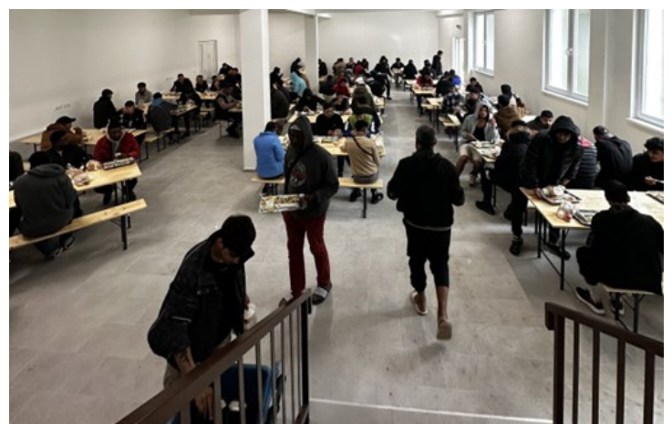
NEW DINING AREA IN TRC BLAŽUJ.

On 17 October, the new dining area at TRC Blažuj was officially opened following the completion of construction work financed by the European Union. The space is fully equipped and includes kitchen tables and chairs, increasing the original capacity of 216 to more than 400 seats. As a result, the expansion significantly reduces the congestion previously caused by the limited capacity of the former dining area.