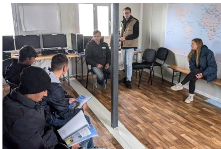
INFO - LEGAL SESSION IN TRC LIPA.

# of beneficiaries reached with info sessions: 1,153