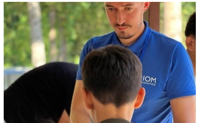
IOM PROVIDED IMMEDIATE ASSISTANCE TO CHILDREN AFFECTED BY A TRAGEDY ON BIH-SERBIA BORDER.

support BiH authorities with the centre's management and humanitarian services during daytime hours. This transition signifies the completion of the management transfer from IOM to the SFA in TRC Blažuj, which is the largest reception centre in BiH.