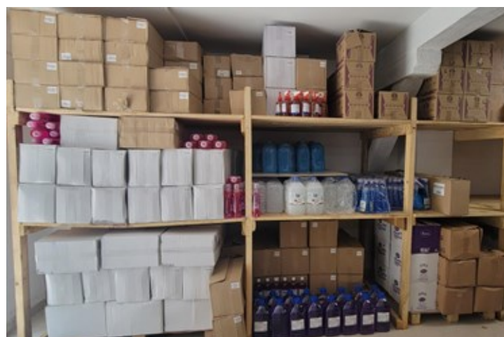
IOM REORGANIZED THE WAREHOUSE AND STORAGE PREMISES IN TRC BLAŽUJ AND TRC UŠIVAK IN PREPARATION OF THE NFI SECTOR HANDOVER FROM IOM TO THE SOCIETY OF RED CROSS BIH.