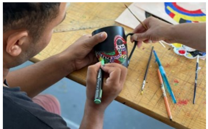
PARTICIPANTS AT THE TRC LIPA CREATIVE ZONE ENGAGING IN A POINTILLISM ART ACTIVITY, USING THE TECHNIQUE TO EMBELLISH UPCYCLED CUPS.

In TRC Ušivak, IOM organized a variety of engaging activities for 21 beneficiaries from Iran, Gambia, Türkiye, among other countries. The activities included sewing, resizing clothes, knitting, artwork, and dancing. The aim was to foster a sense of community and provide relief. Additionally, there was a jewelry-making workshop, where participants created various accessories.