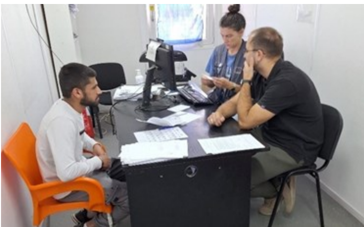
IOM AND THE SFA STAFF REGISTERING A NEW BENEFICIARY IN TRC BLAŽUJ.