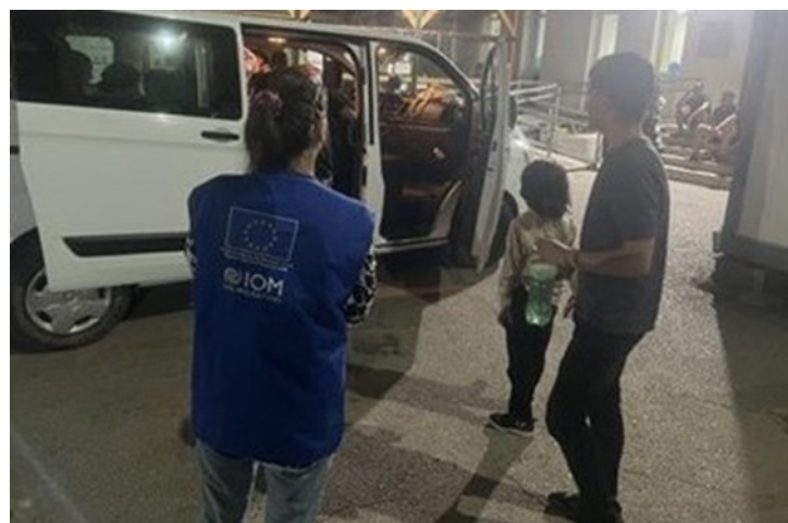
IOM MOBILE TEAM PROVIDING TRANSPORTATION SERVICE TO MIGRANTS IN VULNERABLE SITUATION IN UNA SANA CANTON.

# Assisted Voluntary Returns since 2018: 1,537 M: 1,359 F: 178