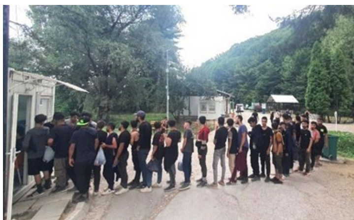
NEW ARRIVALS TO TRC BLAŽUJ.

The increase in the number of transfers of unaccompanied and separated children (UASC) from TRC Blažuj to TRC Ušivak continued, with proper supervision and assistance upon reception. A total of 327 UASC were transferred from TRC Blažuj over the course of the reporting period. At the end of the reporting period, UASC accounted for 67 per cent of the total arrivals in TRC Ušivak, including those initially registered at TRC Ušivak and those transferred from TRC Blažuj. Most children are nationals of the Syrian Arab Republic, followed by Afghanistan, Egypt and Iraq.