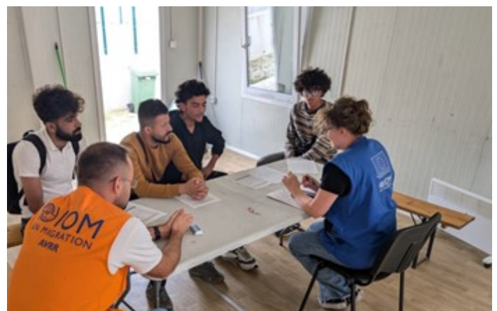
AVRR INFO SESSION.