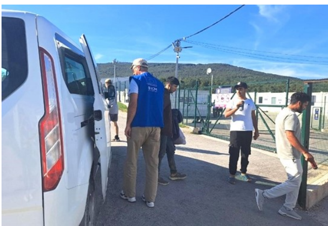
IOM'S MOBILE TEAMS PROVIDING TRANSPORTATION FOR MIGRANTS IN A VULNERABLE SITUATION TO TRC LIPA.

# Assisted Voluntary Returns since 2018: 1,528 M: 1,353 F: 175