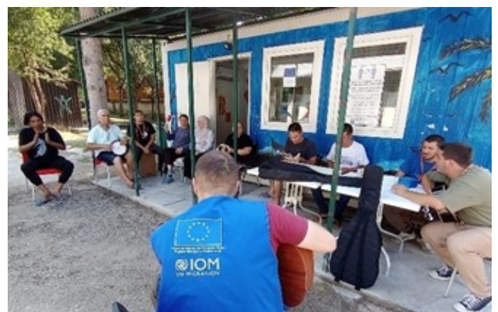
MUSIC WORKSHOP IN TRC UŠIVAK.