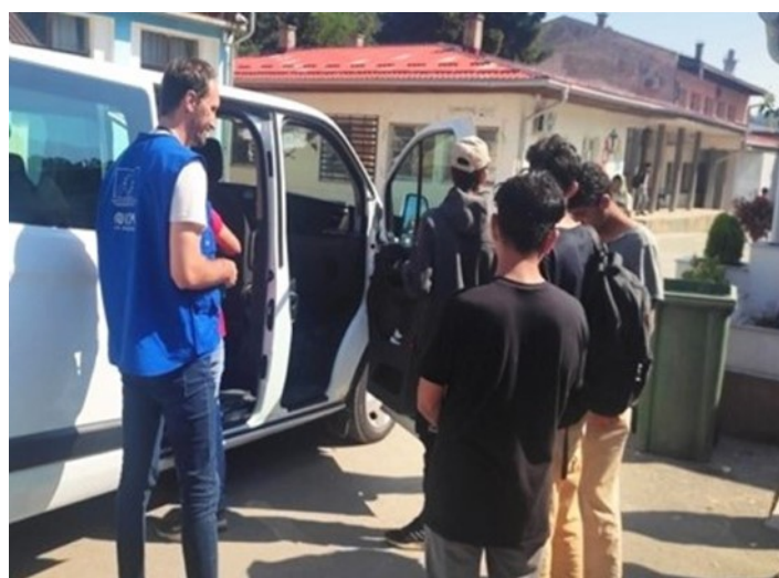
IOM ORGANIZES TRANSFER OF UNACCOMPANIED OR SEPARATED CHILDREN FROM TRC BLAŽUJ TO TRC UŠIVAK IN COLLABORATION WITH THE SFA AND WORLD VISION.

# Assisted Voluntary Returns since 2018: 1,518 M: 1,345 F: 173