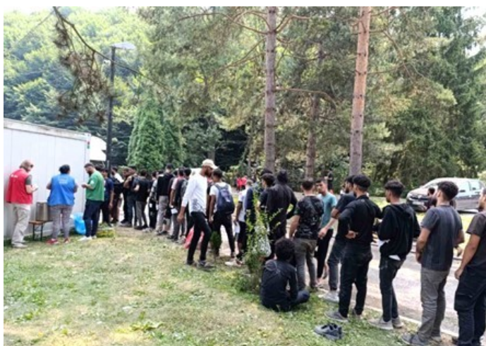
IOM ASSISTED NEWLY ARRIVED BENEFICIARIES IN TRC BLAŽUJ AND OFFERED SOME REFRESHMENTS.

# of vulnerability screenings in TRCs: 1,044