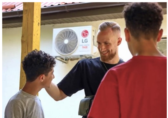
IOM GOODWILL AMBASSADOR FOR BIH, DŽANAN MUSA VISITED RECEPTION CENTRES IN SARAJEVO CANTON.

With the summer months, the number of daily arrivals in TRCs continues to increase. In the reporting period (8 - 21 July), 1,973 arrivals were recorded in TRC Blažuj, in the Sarajevo Canton, representing an increase of 48 per cent compared to the previous period. This trend is increasing pressure on operational capacities, assistance and stocks of food and non-food items (NFIs), with more than 45,077 meals provided, 13,317 non-food items distributed, and 1,044 emergency screenings carried out.