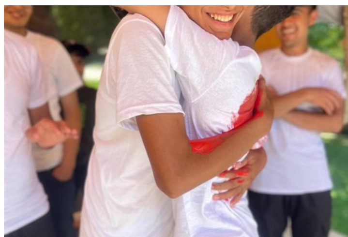
"COLORFUL HUGS" WORKSHOP WAS ORGANIZED FOR CHILDREN IN TRC UŠIVAK.

In TRC Lipa, IOM organized the "Purple Day" event with the active involvement of senior beneficiaries. IOM Lipa set up this event to invite feedback and ideas for enhancing services at the Centre. Consequently, an extra time slot for non-food item distribution has been included in the schedule to cater more effectively to their requirements and minimize wait times, particularly in hot weather.