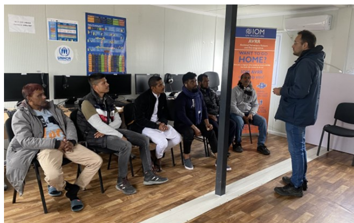
AVRR COUNSELLING SESSION.