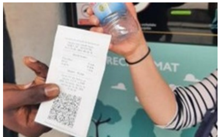
IOM PROMOTES RECYCLING IN RECEPTION CENTRES. TRC BLAŽUJ.

In TRC Ušivak, among other activities, a guitar session was organized and was attended by five unaccompanied and separated children (UASC) from Egypt. Participants acquired some basic skills of playing and learned interesting information about the instrument itself.