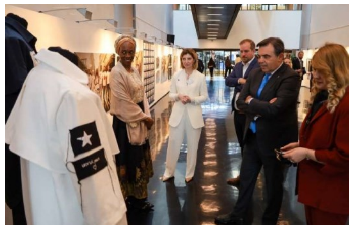
“WEARIN’ IT TOGETHER” EXHIBITION WAS PRESENTED IN THE EUROPEAN PARLIAMENT IN STRASBOURG.

On 23 April, in Strasbourg and within the premises of the European Parliament, IOM organized the exhibition “Wearin’ it together!”. Building on its premieres in Sarajevo and Belgrade, the exhibition presented approximately 50 photographs by renowned Franco Pagetti, featuring migrants residing in BiH and Serbia adorned with No Nation Fashion garments, along with a curated selection of his work with Dolce and Gabbana, providing a rich visual story transcending borders and cultures.