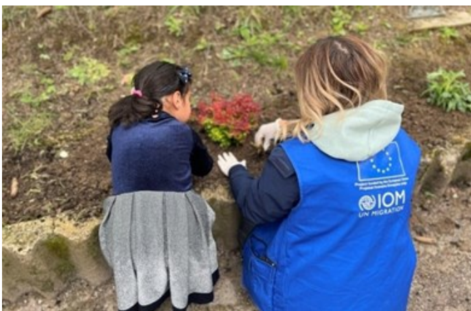
A FLOWER PLANTING EVENT WAS ORGANIZED IN TRC UŠIVAK TO CELEBRATE EARTH DAY.