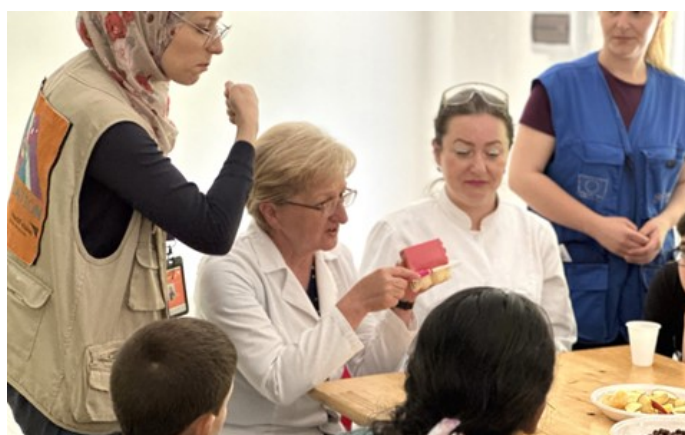
INFORMATIVE HEALTH SESSION ON ORAL HEALTH AND HYGIENE WAS ORGANIZED FOR BENEFICIARIES IN TRC UŠIVAK.

In TRC Borići, IOM hosted a meeting with partner organizations including UNFPA, UNICEF, WVI and DRC to coordinate protection activities to tackle the problem of substance abuse and to improve prevention measures. The participants collaborated on the plan of action that aim to inform the beneficiaries about the health risks and outcomes of substance abuse.