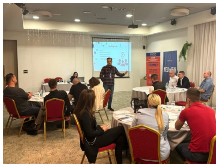
THE TRAINING "APPLICATION OF A RIGHTS-BASED APPROACH TO COUNSELLING AND ASSISTANCE ON RETURN" WAS ORGANIZED BY IOM FOR THE SFA STAFF IN SARAJEVO AND BIHAĆ.

# Assisted Voluntary Returns since 2018: 1,498 M: 1,329 F: 169