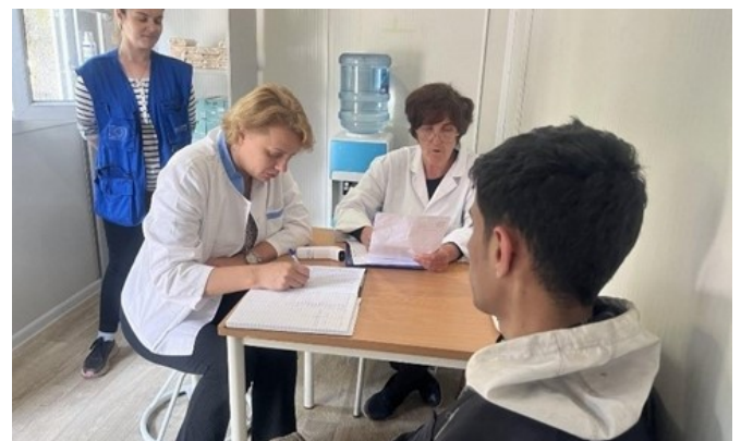
PRIMARY HEALTH CENTRES PERFORM ENTRY MEDICAL SCREENINGS IN TRC UŠIVAK AND TRC BLAŽUJ.

process. They also discussed how to address the needs and identify migrants in a vulnerable situation, with a special focus on providing return counselling to families and unaccompanied and separated children.