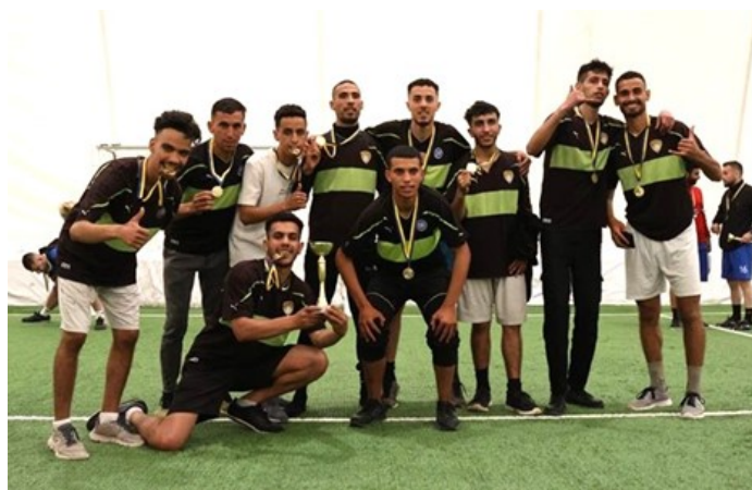
TEAM OF BENEFICIARIES FROM MAROCCO WON THE FOOTBALL TOURNAMENT ORGANIZED IN TRC BLAŽUJ BY FC RESPEKT.