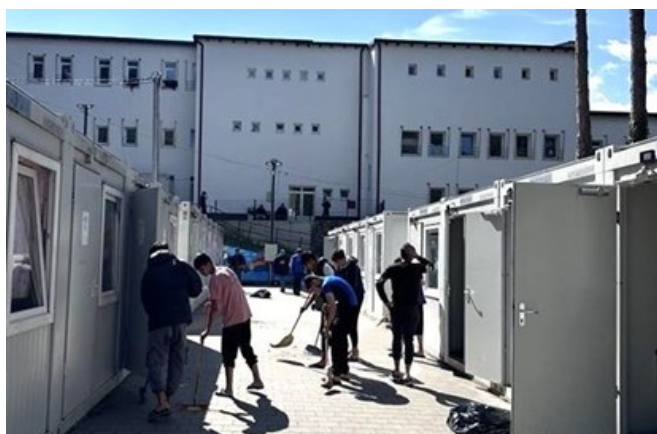
SPRING CLEANING IN TRC BORIĆI.

# Assisted Voluntary Returns since 2018: 1,463 M: 1297, F: 166