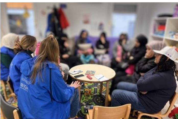
INTERACTIVE GROUP SESSION “WOMEN’S DIALOGUES” WAS ORGANIZED IN TRC UŠIVAK.

In TRC Borići, IOM organized a spring cleaning in anticipation of the upcoming holidays celebrated in different cultures and confessions (Nowruz, Easter, and Eid al-Fitr). IOM and migrant volunteers cleaned all accommodation rooms and communal areas including the exterior part of the centre, the main plateau, the courtyard and the community kitchen.