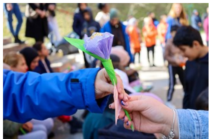
INTERNATIONAL WOMEN'S DAY WAS MARKED IN ALL RECEPTION CENTRES.

Many activities took place in TRCs to mark International Women's Day on 8 March. In TRC Ušivak, a Dance and Theatre workshop was offered to migrant women by the NGO SCENA. In TRC Lipa, representatives of the Technical Faculty Bihać, beneficiaries, and IOM staff prepared Boxes of Friendship filled with products made in the Creative Zone, and distributed boxes to members of the Cancer Support Associations in Bihać, Cazin, Velika Kladuša and Bosanski Petrovac.