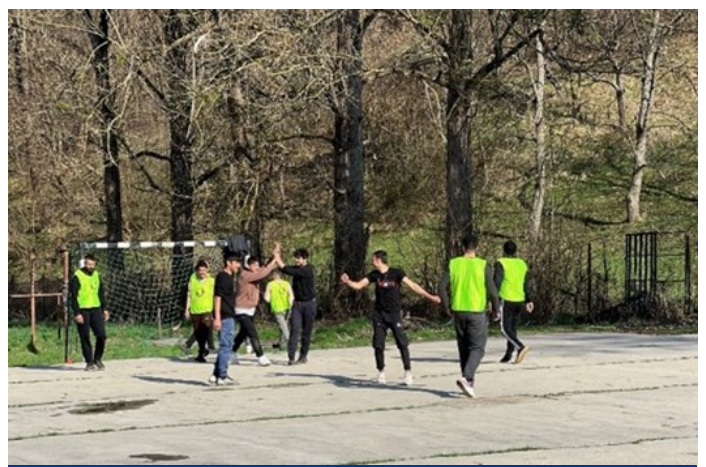
IOM ORGANIZES COMMUNITY SUPPORT ACTIVITIES IN ALL TRCs INCLUDING SPORT AND PLAY EVENTS. A FOOTBALL TRAINING IN TRC BLAŽUJ.