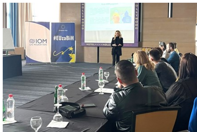
TRAINING FOR SFA STAFF ON CULTURAL COMPETENCIES, MEDIATION AND THE VULNERABILITY OF MIGRANTS WAS HELD IN BIHAĆ.