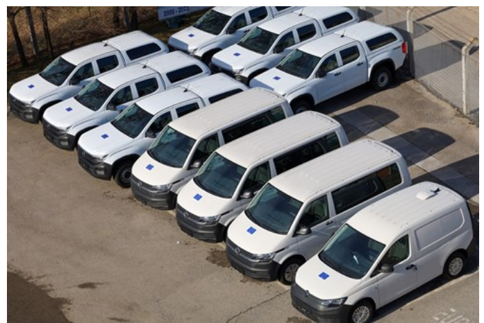
TEN VEHICLES WERE DONATED TO THE BORDER POLICE THROUGH THE EU FUNDED PROJECT SPECIAL MEASURES TO SUPPORT THE RESPONSE TO THE REFUGEE AND MIGRANT SITUATION IN BIH .