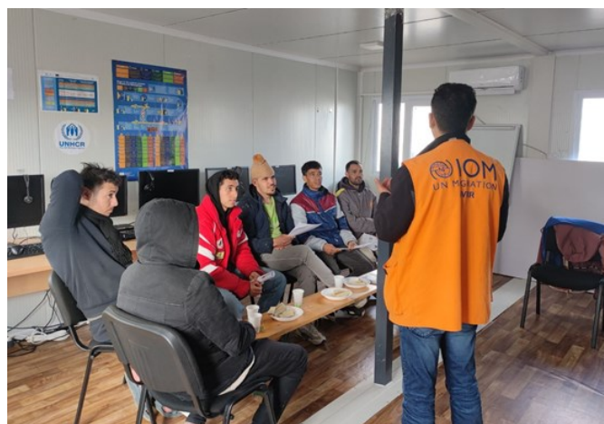
AVRR INFORMATION SESSION DELIVERED BY IOM.

# Assisted Voluntary Returns since 2018: 1,446, M: 1280, F: 166