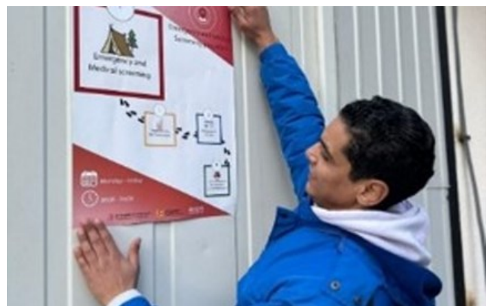
IOM UPDATES INFO POSTERS CONTAINING INFORMATION ON SERVICES IN RECEPTION CENTRES IN LINE WITH THE OPERATIONAL CHANGES, EMERGING NEEDS AND REQUESTS BY BENEFICIARIES.

In TRC Blažuj, IOM held a Mental Health and Psychosocial Support (MHPSS) session for six beneficiaries from different ethnic backgrounds to discuss notions such as prejudice and stereotypes. The session aimed to create a mutual understanding among people from different cultures and contribute to peaceful coexistence in the centre. IOM staff was conducting night patrols of the accommodation units in TRC Blažuj accompanied by the DPCB officers to maintain a secure environment for all residents.