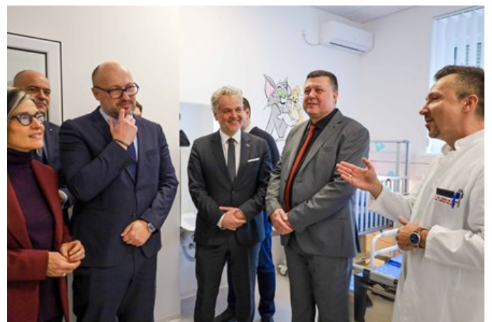
OPENING OF THE RENOVATED DEPARTMENT OF PEDIATRIC SURGERY OF THE CANTONAL HOSPITAL "DR IRFAN LJUBIJANKIĆ" IN BIHAĆ.

The meeting was an opportunity to discuss mixed migration trends and further strengthen cooperation between the SFA and IOM for the provision of assistance to migrants in BiH.