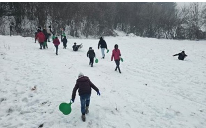
IOM ORGANIZED A WINTER EVENT FOR CHILDREN IN TRC UŠIVAK INCLUDING SLEDDING, A TUG OF WAR AND A TEA AND SWEETS PARTY.

# of emergency screenings in TRCs: 1,436