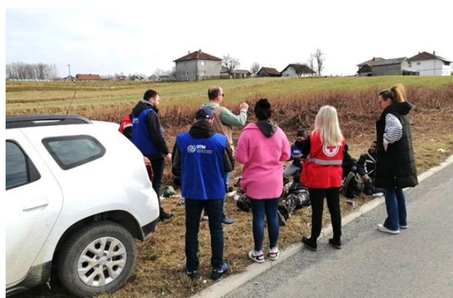
IOM'S MOBILE TEAMS PROVIDING ASSISTANCE TO MIGRANTS IN UNA SANA CANTON IN COOPERATION WITH PARTNER ORGANIZATIONS.

# Assisted Voluntary Returns since 2018: 1,438, M: 1272, F: 166