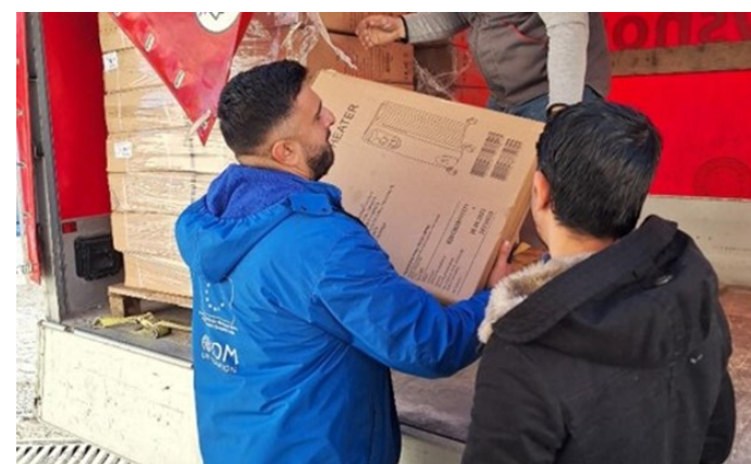
ADDITIONAL 40 NEW HEATERS WERE PROVIDED BY IOM FOR ACCOMODATION UNITS IN TRC BLAŽUJ.