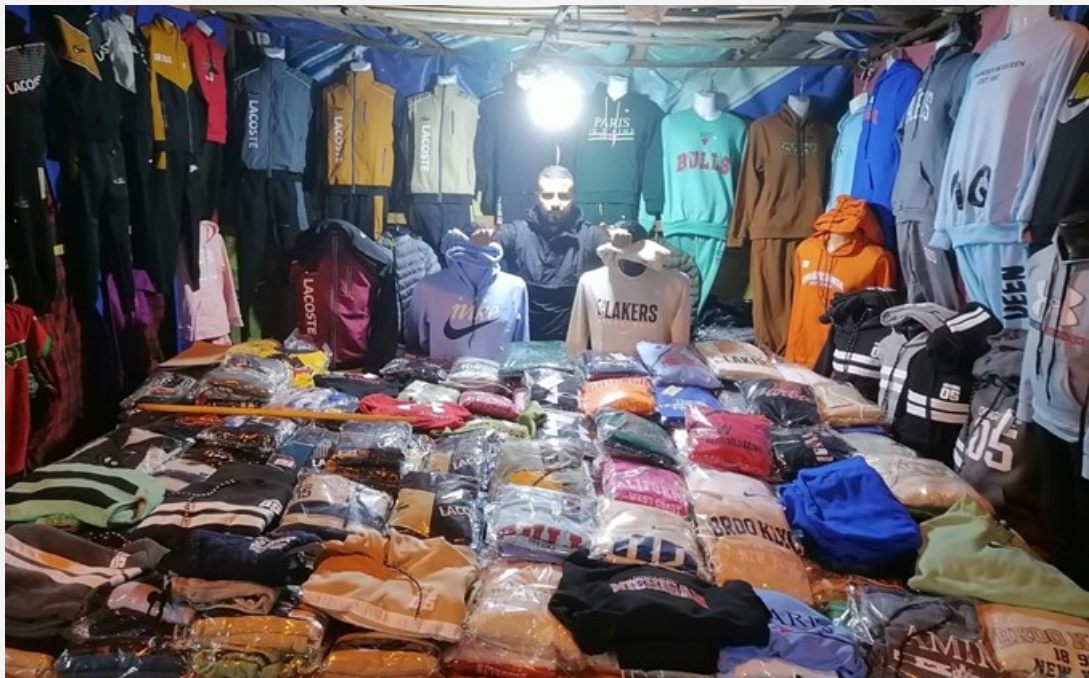
IT IS A NEW START FOR MOHAMED* WHO OPENED A CLOTHES SHOP IN HIS HOMETOWN WITH THE HELP OF IOM'S AVRR PROGRAMME.