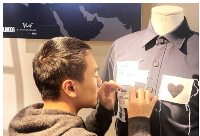
THE FIRST NO NATION FASHION CAPSULE COLLECTION "7,689 KM - FROM KABUL TO BERLIN" IS INSPIRED BY HUMAN STORIES.

On 9 January, as part of the No Nation Fashion brand, IOM presented the capsule clothing collection "7,689 km - from Kabul to Berlin", at an event organized with POLIMODA as part of this year's Pitti Immagine Uomo in Florence. The name of the collection emphasizes migrants' journey from Kabul to Berlin, transiting through BiH, and is inspired by their human stories, lives and aspirations.