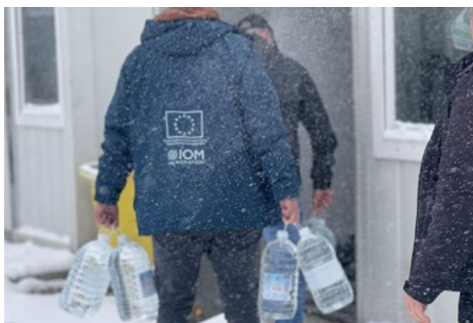
IOM STAFF IN TRC LIPA PROVIDING ASSISTANCE TO BENEFICIARIES.

# of emergency screenings in TRCs: 2,181