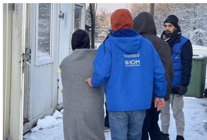
DEMAND FOR ACCOMMODATION AND ASSISTANCE IN RECEPTION CENTRES HAS RISEN IN WINTER MONTHS. IOM PROVIDING ASSISTANCE TO BENEFICIARIES IN TRC BLAŽUJ.