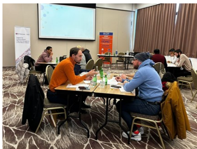
THE FIRST TRAINING SESSION WITHIN THE ROLLOUT OF THE "RETURN COUNSELLING TOOLKIT" WAS HELD IN SARAJEVO ON 17-18 JANUARY 2024 FOR IOM STAFF AND STAFF FROM PARTNER ORGANIZATIONS.

# Assisted Voluntary Returns since 2018: 1,420, M: 1255, F: 165