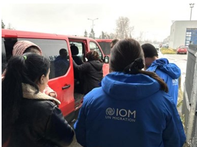
IOM MOBILE TEAMS PROVIDING TRANSPORTATION ASSISTANCE TO TWO FAMILIES, NFI AND BABY FOOD FOR AN ELEVEN MONTH OLD BABY IN ORAŠJE.