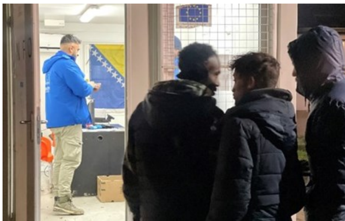
PRE-REGISTRATION PROCESS IN THE NEWLY SET INFO CONTAINER IN TRC BLAŽUJ.

# of emergency screenings in TRCs: 2,541