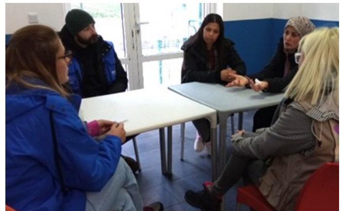
COMPLAINT AND FEEDBACK MECHANISM SESSION IN TRC UŠIVAK.

In TRC Ušivak, the Feedback and Complaint Committee meeting was held on 26 December. The meeting was led by IOM with the attendance of World Vision representative and two women from the Syrian Arab Republic who are migrant community representatives. The committee reviewed one complaint which referred to the Non-Food Items (NFI) distribution process. The Committee members discussed the complaint, and the response will be provided in accordance with the standard operational procedures. In TRC Ušivak, – an informative session on legal processes was held in cooperation with IOM and NGO Vaša Prava for beneficiaries from Iran and Afghanistan. The beneficiaries received information about legal residence in BiH, the process of seeking asylum, and information about assisted voluntary return. A Mine Risk Education/Awareness session was held by IOM in TRC Ušivak on 28 December, where 5 migrants (3 women and 2 men) from Nepal, Pakistan and Afghanistan participated. The translation into Panjabi, Urdu and Pashto languages was provided by IOM interpreters. The participants indicated that they had observed landmine signs during their movements, which highlights the importance of continuous mine risk awareness raising to enhance the safety of migrants in BiH.