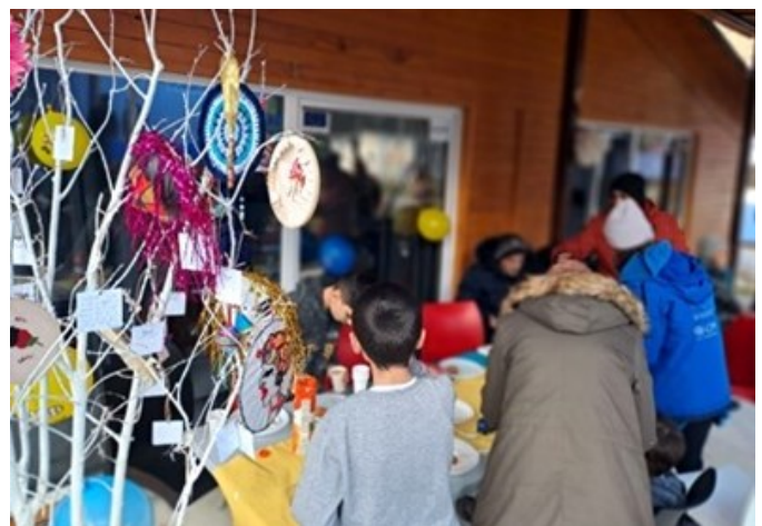
NEW YEAR'S CELEBRATION FOR CHILDREN WITH MUSIC, ANIMATIONS AND CAKES IN TRC UŠIVAK.

To mark the end of the year and the Catholic and Orthodox Christmas, special events and celebrations were organized in all TRCs in BiH. In TRC Lipa, IOM, in coordination with the SFA, organized traditional Christmas lunches on 25 December and 7 January for migrants accommodated in the center: