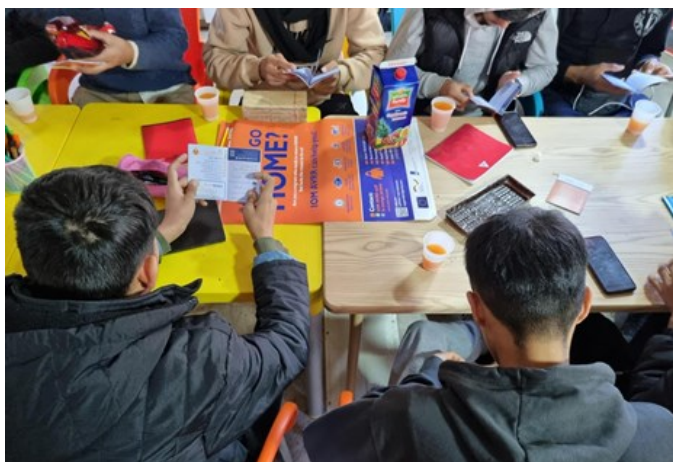
AVRR INFO SESSION IN TRC UŠIVAK.

# complementary baby food distributed: 697