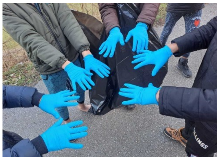
MIGRANT VOLUNTEERS FROM TRC UŠIVAK PARTICIPATED IN A CLEANING ACTION IN THE LOCAL COMMUNITY.