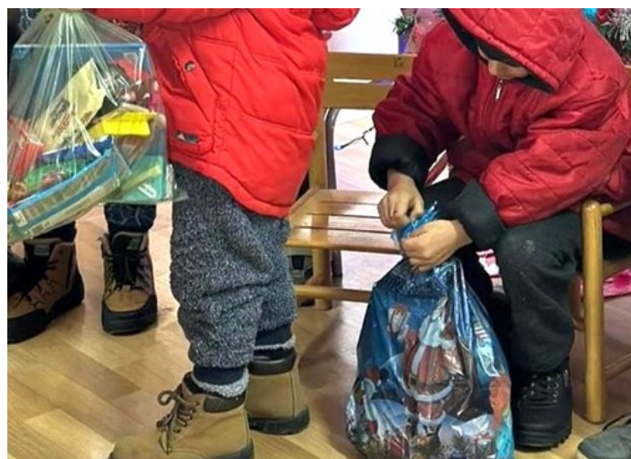
NGO "RUKU NA SRCE" FROM SARAJEVO DONATED NEW YEAR'S GIFTS FOR CHILDREN. IOM AND WORLD VISION ORGANIZED A GIFT CEREMONY FOR MORE THAN 100 CHILDREN IN TRC UŠIVAK.

In TRC Ušivak, IOM organized a Community Participation Meeting with the attendance of our partner organization, the BiH Women Initiative, with the aim to ensure that the provision of services align closely with needs of the diverse migrant population residing in the TRC. Ten migrants (9 women and 1 men), originating from the Syrian Arab Republic, Kuwait, the Islamic Republic of Iran, and Türkiye, participated and provided feedback concerning the NFI and hygiene in accommodation units. IOM, in collaboration with World Vision (WV), worked to facilitate the accommodation of newly arrived unaccompanied and separated children (UASC) in TRC Ušivak, ensuring that accommodation facilities are equipped with beds, mattresses, and heaters.