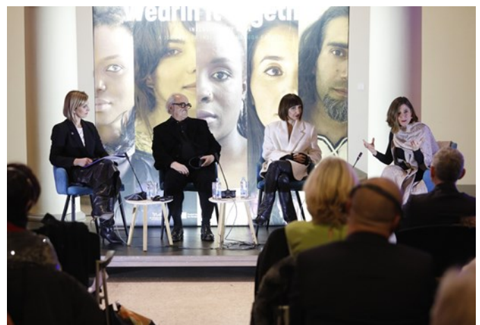
OPENING OF THE "WEARIN'IT TOGETHER" EXHIBITION IN THE NATIONAL MUSEUM OF BIH. THE EXHIBITION IS OPEN UNTIL 14 JANUARY 2024.

On 18 December, to mark International Migrants Day, IOM organized various activities in all Temporary Reception Centres (TRCs). In TRC Lipa, IOM and partner organizations presented their activities to local and cantonal authorities and guests. In TRC Borić, pupils from Richmond Park Elementary School in Bihac accompanied by their teachers, exchanged gifts with children during their visit to the reception centre. In TRC Ušivak, the kids helped with the distribution of delicious meals prepared in the community kitchen, where migrant women and men cooked the most famous dishes from their homeland. In TRC Blažuj, singing, dancing and Moroccan pastries marked the joyful celebration.