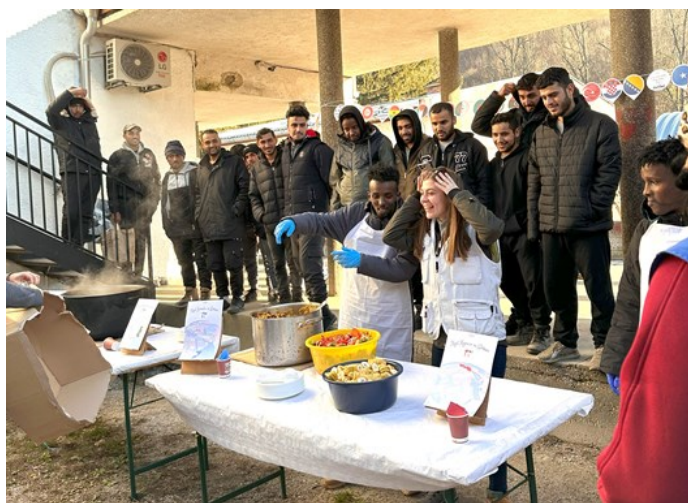
INTERNATIONAL MIGRANTS DAY CELEBRATION IN TRC BLAŽUJ INCLUDED A COOKING ACTIVITY. MIGRANTS FROM MOROCCO, PAKISTAN, AFGHANISTAN, AND SOMALIA PREPARED THEIR NATIONAL DISHES.

# of emergency screenings in TRCs: 2,393