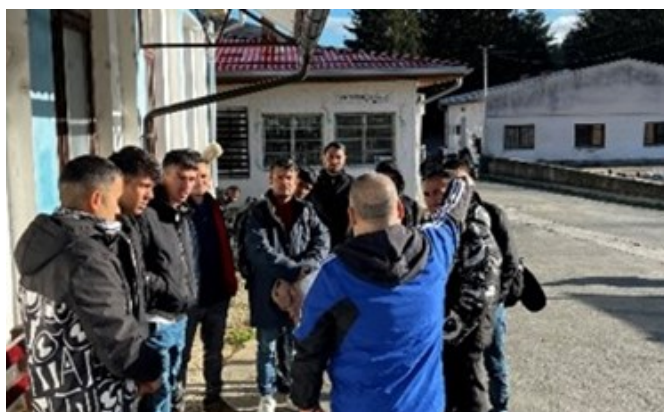
IOM STAFF MEMBER EXPLAINING THE REGISTRATION PROCEDURE TO NEWLY ARRIVED MIGRANTS IN TRC BLAŽUJ.

In TRC Blažuj, during the reporting period, IOM's Protection and Mental Health and Psychosocial Support (MHPSS) team continue to contribute to creating a safe, inclusive environment and to provide personalized support to members of various communities, including one member of the LGBTIQ+ community.