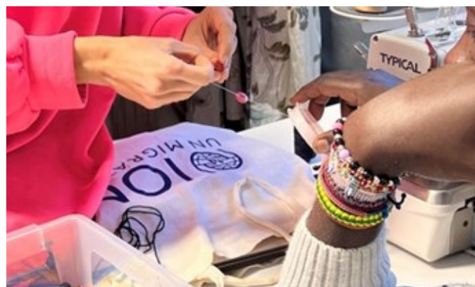
CREATIVE WORKSHOP IN TRC UŠIVAK.