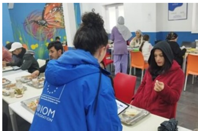
FOOD SATISFACTORY SURVEYING IN TRC UŠIVAK.

# complementary baby food distributed: 507