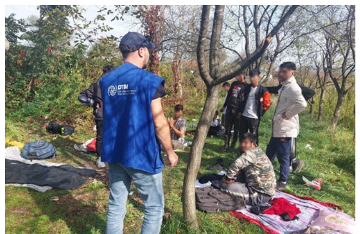
IOM'S DISPLACEMENT TRACKING MATRIX ROUTE OBSERVATION EXERCISE IS PERFORMED EACH MONTH.

On 30 October, members of the diplomatic community in BiH visited the No Nation Fashion (NNF) corner in the Temporary Reception Center Ušivak. The aim of the visit was to present the NNF initiative as an inclusive space for migrants of all genders and ages and to showcase their development path, journeys, stories and talents.