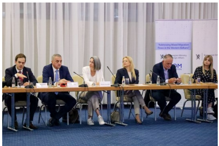
IOM ORGANIZED A TRAINING TO ENHANCE PROTECTION TO UNACCOMPANIED AND SEPARATED CHILDREN IN BIH WITH THE SUPPORT OF THE KINGDOM OF NORWAY.

On 21-22 June, IOM and the Service for Foreigners' Affairs (SFA), with the support of the Kingdom of Norway, organized a training to enhance protection and assistance to unaccompanied and separated children, with participation of both IOM mobile teams and SFA officials involved in the mixed migration response, as well as representatives of centres for social work, UNICEF, Save the Children, and Jesuit Refugee Service. The objective of the training was to strengthen cooperation and harmonize practices to better protect and assist vulnerable migrants.