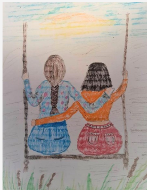
DRAWING MADE BY A BENEFICIARY IN ONE OF THE RECEPTION CENTRES AT THE CREATIVE WORKSHOP.