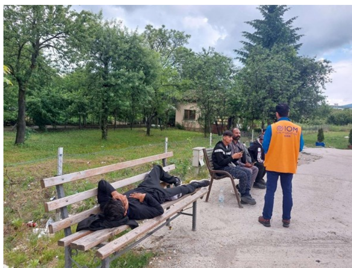
AVRR INFORMATION SHARING FOR MIGRANTS OUTSIDE OF RECEPTION CENTRES IN SARAJEVO CANTON.

# Assisted Voluntary Returns in 2023: 36