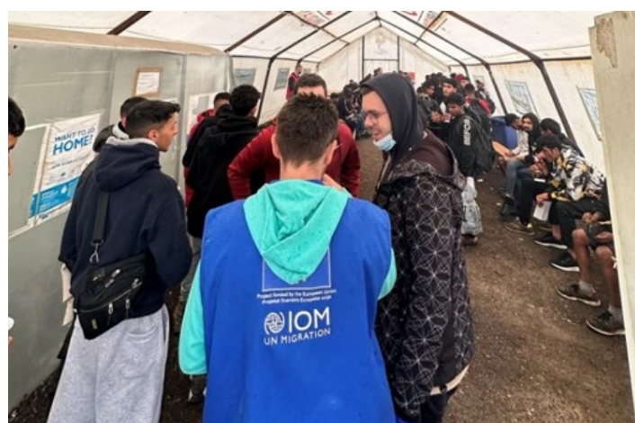
NEWLY ARRIVED MIGRANTS IN TRC BLAŽUJ DURING THE REGISTRATION PROCEDURE

In TRC Ušivak, the number of admissions of people also increased during the evening hours and nighttime. During the reporting period, several relocations of families and unaccompanied or separated children (UASC) were carried out during the night from TRC Blažuj to TRC Ušivak to enable adequate assistance for this group. The IOM camp coordination and camp management (CCCM) team in coordination with the SFA admitted 146 unaccompanied or separated children (UASC) following the coordinated relocation from TRC Blažuj.