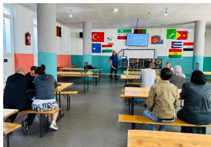
MINE RISK EDUCATION SESSIONS ARE IMPLEMENTED FOR MIGRANTS IN RECEPTION CENTRES BY IOM TO INCREASE THEIR KNOWLEDGE ON MINE RELATED RISKS IN BIH.