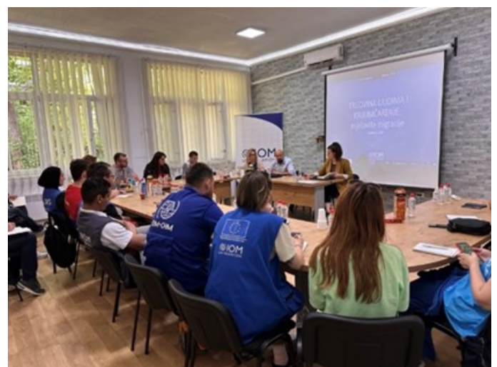
THE GUIDEBOOK "SMUGGLING AND HUMAN TRAFFICKING PREVENTION AND PROTECTION" WAS DEVELOPED BY IOM AND PRESENTED IN SERIES OF EVENTS TO THE MAIN MIGRATION RESPONSE STAKEHOLDERS AND STAFF ENGAGED IN DIRECT WORK WITH MIGRANTS IN RECEPTION CENTRES.

On the joint initiative of IOM BiH and the Technical Faculty of the University of Bihać, in coordination with the SFA and UNHCR, a pilot Informatics and Programming project was launched in the Temporary Reception Center (TRC) Lipa. The project aims to improve migrants and asylum seekers' skills and knowledge in the field of IT and programming.