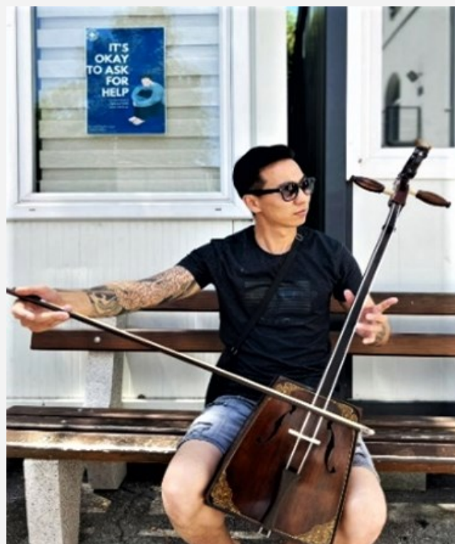
TRADITIONAL MONGOLIAN TUNES RESONATED IN TRC BORIĆI THANKS TO ALTAN* MASTERY WITH THE MOORIN KHUUR INSTRUMENT.

*The name has been changed to protect privacy