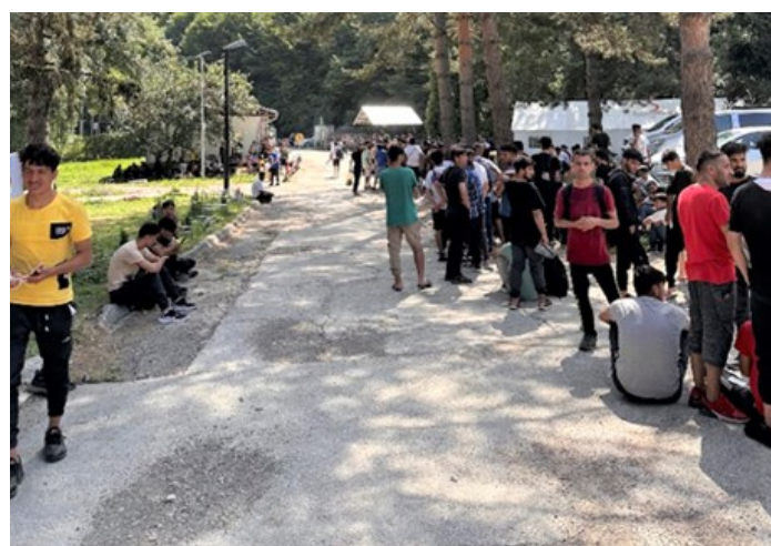
NEWLY ARRIVED MIGRANTS WAITING FOR REGISTRATION AND EMERGENCY SCREENING IN TRC BLAŽUJ.

In TRC Ušivak, IOM's camp coordination and camp management (CCCM) team in coordination with the SFA admitted 112 unaccompanied or separated children (UASC), eleven families and one single women, following the coordinated relocation from TRC Blažuj to TRC Ušivak. The admission process was also carried out in coordination with World Vision regarding the legal guardians support.