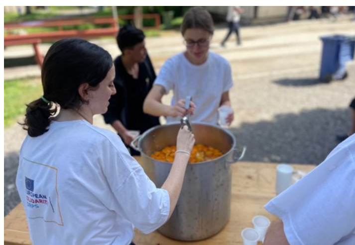
IOM SERVES REFRESHMENT FOR NEWLY ARRIVED MIGRANTS WAITING IN LINE IN TRC BLAŽUJ.

In TRC Blažuj, IOM organized a protection coordination meeting with DRC, Médecins du Monde (MdM) and UNFPA. The primary focus was to discuss crucial issues affecting the beneficiaries' protection and well-being. Key outcomes from the meeting include a decision to develop a new roadmap for reporting Gender-Based Violence (GBV) incidents and enhance measures to effectively combat GBV. Furthermore, participants agreed to organize a GBV refresher training to improve the knowledge and capabilities of the TRC staff and partners in dealing with GBV-related cases sensitively and effectively. This initiative will strengthen the safeguarding mechanisms in place and foster a more supportive and secure environment for beneficiaries.