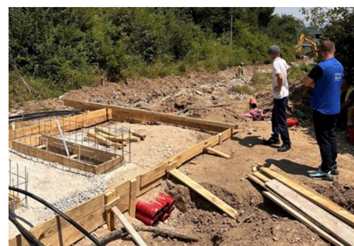
WORKS IN PROGRESS ON BUILDING A POWER SUBSTATION IN TRC BLAŽUJ THAT WILL REPLACE GENERATORS.