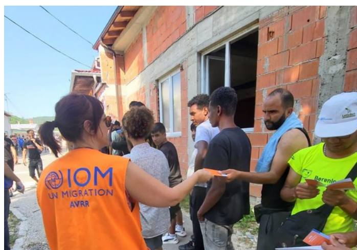
IOM AVRR TEAM SHARING INFORMATION ABOUT AVRR SERVICES IN BIH FOR MIGRANTS IN OUTREACH.

# Assisted Voluntary Returns in 2023: 39