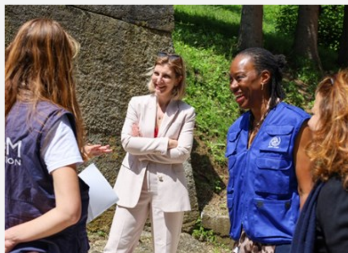
IOM DDG WAS HOSTED BY IOM BiH COM IN A VISIT TO TRC UŠIVAK WHERE THEY ENGAGED IN TALKS WITH BENEFICIARIES, LISTENED TO THE FIRST ACCOUNT STORIES AND GAVE FEEDBACK.

Since the start of the migration response by IOM in BiH in 2017-2018, over 12,537 women received services in reception facilities, representing approximately 11 per cent of all people assisted. Female staff currently represent 44 per cent of the IOM staff working in TRCs in BiH.