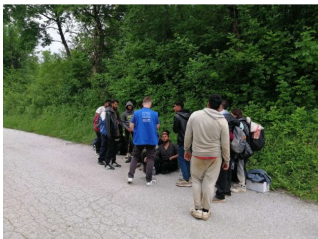
IOM'S MOBILE TEAM ASSISTING MIGRANTS OUTSIDE TRCS.