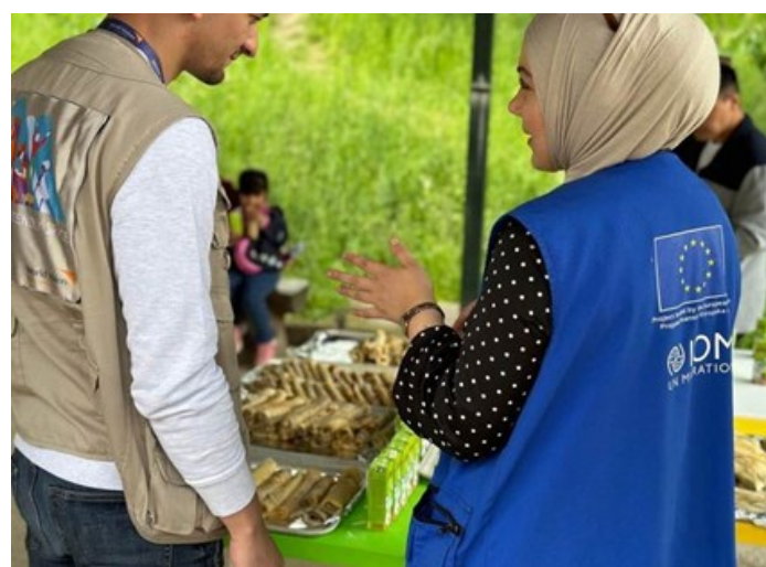
IOM ORGANIZED "PANCAKE DAY" IN TRC UŠIVAK FOR MIGRANTS AND STAFF IN COOPERATION WITH CARITAS AND WORLD VISION .