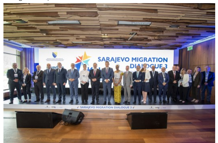
THE THIRD SARAJEVO MIGRATION DIALOGUE WAS ORGANIZED ON 8-9 JUNE IN JAHORINA, GATHERING 167 HIGH-LEVEL REPRESENTATIVES OF THE WESTERN BALKANS, THE EU AND PARTNERS.

migration governance and welcomed the authorities' increased ownership over the migration response in BiH.