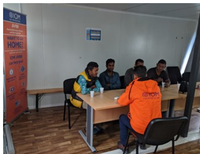
AVRR INFO SESSION IN TRC LIPA.

# Assisted Voluntary Returns in 2023: 34