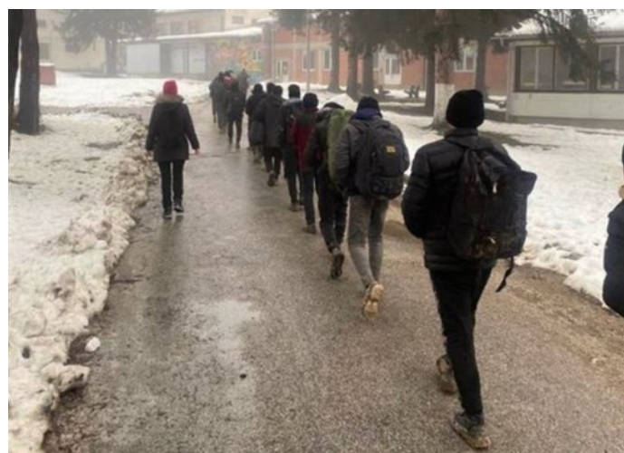
97 PEOPLE ARRIVED TO TRC BLAŽUJ ON 3 MARCH. IOM STAFF PROVIDED PROTECTION SENSITIVE SERVICES AT THE CENTER.

In TRC Ušivak and TRC Borići, a new leaflet has been created and is distributed daily to migrants. The leaflet consists of information on procedures and services provided by IOM and partner organizations in the center as well as important services available in the local community such as the first pharmacy, bus station. The leaflet also contains a map of the center as well as a description of relevant procedures for all new arrivals