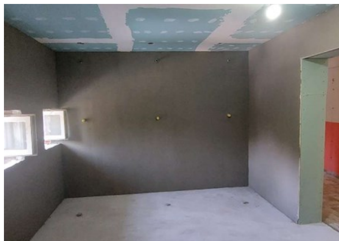
RENOVATION OF WASH FACILITIES IN TRC BORIĆI WILL BE COMPLETED BY THE END OF MARCH.

During the reporting period, IOM's mobile teams provided 41 transportation services for 57 migrants and conducted 89 information sessions.