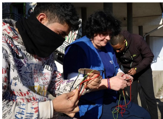
THE SEWING AND KNITTING WORKSHOPS IN TRC BLAŽUJ ENCOURAGED MIGRANTS TO EXPRESS THEIR CREATIVITY.

# of referrals to specialized and non-specialized services: 129