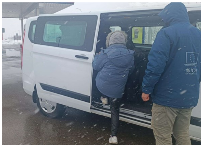
IOM MOBILE TEAM PROVIDING TRANSPORTATION ASSISTANCE FOR BENEFICIARIES REFERRED BY THE SFA.