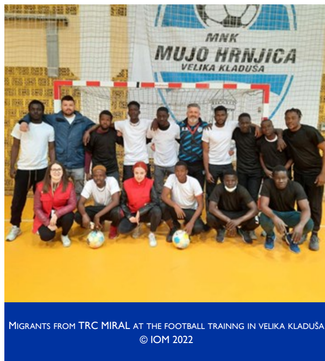
MIGRANTS FROM TRC MIRAL AT THE FOOTBALL TRAINING IN VELIKA KLADUŠA

# of persons assisted with laundry services: 924