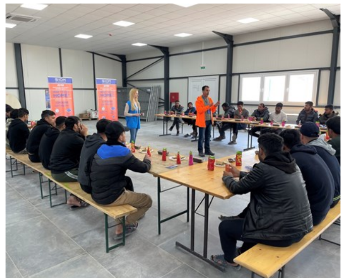
AN AVRR INFORMATION SESSION IN TRC LIPA

(DPCB) in all TRCs in order to assess the security situation and prepare for the handover between private security companies and the DPCB.