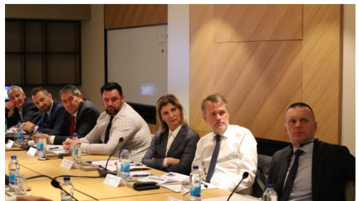
PROJECT PRESENTATION IN BANJALUKA ON 30 MARCH

human trafficking in BiH. The training was organized by IOM within the project "Short-term and medium-term support in the field of combating trafficking in human beings in BiH," funded by the U.S. Department of State, Bureau of International Narcotics and Law Enforcement (INL).