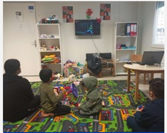
CARTOON TIME IN TRC UŠIVAK

*Name has been changed to protect privacy.