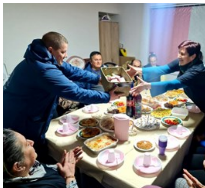
TRC MIRAL BENEFICIARIES AND STAFF VISIT TO „SUTRA JE NOVI DAN“ ORGANIZATION