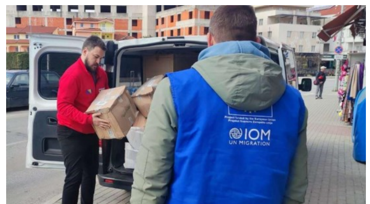
IOM STAFF PREPARE TO DISTRIBUTE ITEMS TO UKRAINIAN REFUGEES IN MEDUGORJE.

affirmation of women rights, with a narration about the historical context of the women's emancipation movement, was organized for beneficiaries and TRC staff.