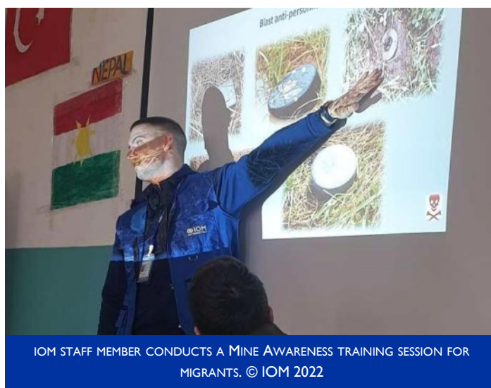
IOM STAFF MEMBER CONDUCTS A MINE AWARENESS TRAINING SESSION FOR MIGRANTS.

# of protection/MHPSS services provided by IOM: 2,535