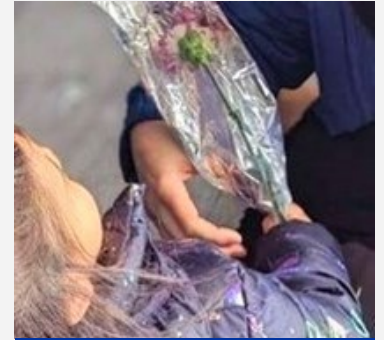
A SMALL GIFT OF GENEROSITY