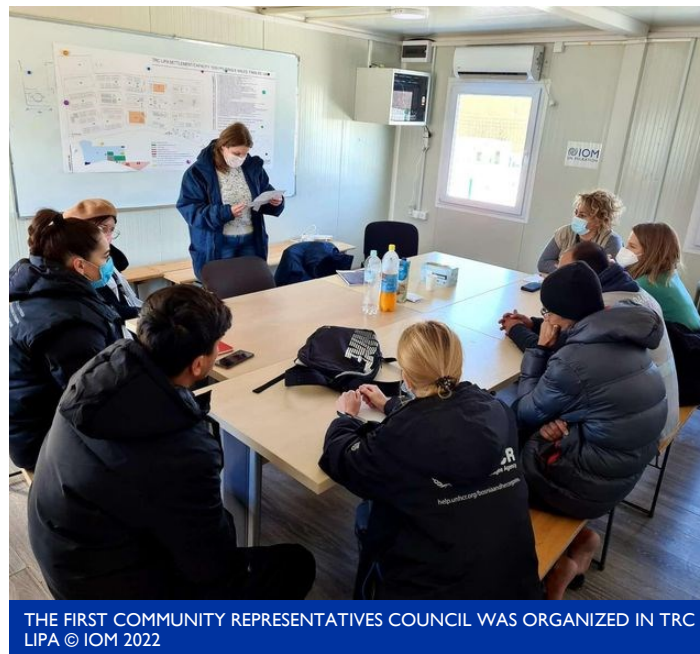
THE FIRST COMMUNITY REPRESENTATIVES COUNCIL WAS ORGANIZED IN TRC LIPA

IOM works actively on supporting accountability to affected populations (AAP) through coordination of participation mechanisms in the TRCs. Beneficiaries are encouraged to play an active role in decision making processes. In TRC Lipa, the first Community Representatives Council (CRC) was organized by SFA, with support from IOM and UNHCR. The roles and obligations of community representatives were presented to beneficiaries and constructive discussion followed. It was agreed that the CRC will be organized on a bi-weekly basis. The topics discussed during the first CRC meeting included the provision of food in the centre and issues related to the community kitchen, praying areas, and sanitary showers. Furthermore, the Complaint and Feedback Committee was also established. One complaint was registered in the Complaint Box and processed in accordance with regulations. Beneficiaries who participated in the Committee expressed satisfaction with the launch of these mechanisms. In TRC Miral, issues identified by IOM and beneficiaries were discussed at the CRC meeting, including maintenance of the hygiene facilities, security in the centre, and upcoming education and recreation activities. Community council activities serve to address different issues and problems as well as strengthen trust and cooperation between beneficiaries and staff working in TRCs.