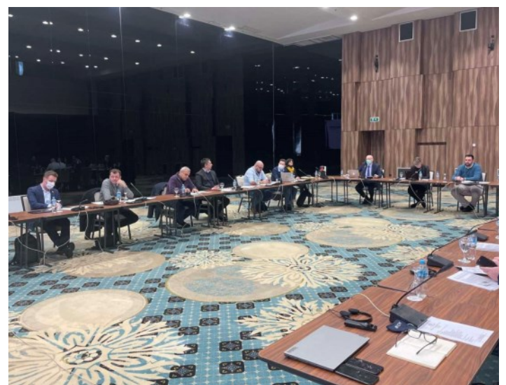
"TRANSITION PLAN FOR MIGRANTS HEALTH CARE SERVICES PROVISION IN BOSNIA AND HERZEGOVINA" MEETING IN SARAJEVO

Regular vaccination of beneficiaries against COVID-19 continued in TRCs Miral, Blažuj and Ušivak. So far, a total of 863 migrants have been vaccinated since the beginning of the immunization process. DRC and IOM will ensure accessible Ag-RDT testing for all service providers working inside TRCs in the next period.