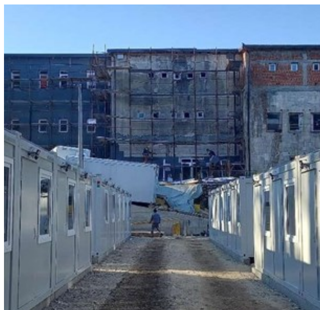
NEW HOUSING CONTAINERS POSITIONED IN TRC BORIĆI

# of persons assisted with laundry services: 1,028