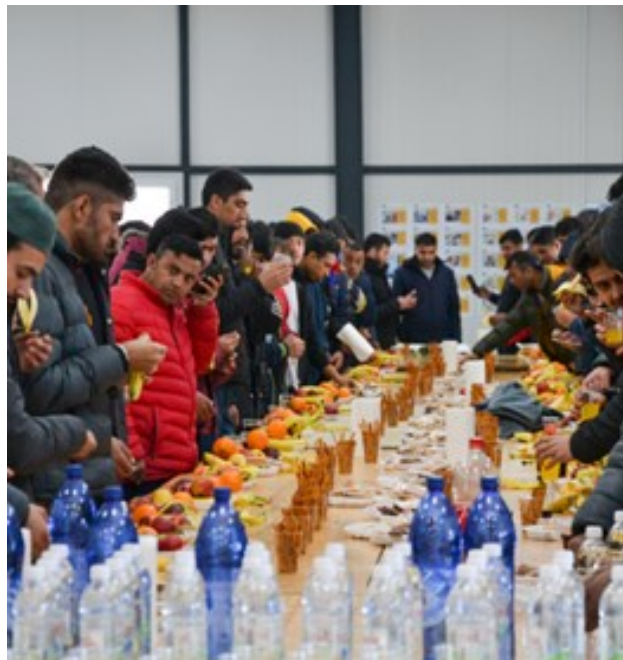
CELEBRATION OF 100 DAYS SINCE THE ESTABLISHMENT OF TRC LIPA

# of protection/MHPSS services provided by IOM: 2,550