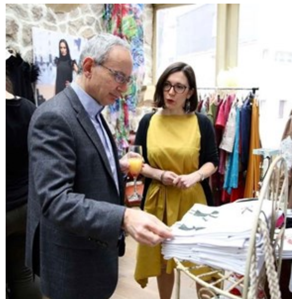
POP-UP SHOW IN SARAJEVO FOR THE NO NATION FASHION BRAND

On 3 March, a meeting of key actors engaged in the prevention of human trafficking and migrant smuggling from Montenegro and Bosnia and Herzegovina took place at the Ministry of Security of BiH in Sarajevo. Participants discussed modalities for strengthening co-operation in the field of combatting human trafficking and presented innovative solutions for strengthening mutual coordination of key actors as well as improving local capacity.