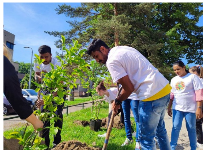
MIGRANTS FROM TRC BORIĆI PLANT TREE SEEDLINGS IN HARMANI, BIHAĆ.

Eleven migrants from TRC Borići joined local volunteers in the planting of tree seedlings at two playgrounds in Harmani, Bihac. This activity was organized by IOM and the local NGO, the Centre for Sustainable Development. The migrants from India who participated promised to come back to Bihac one day to see the trees bloom.