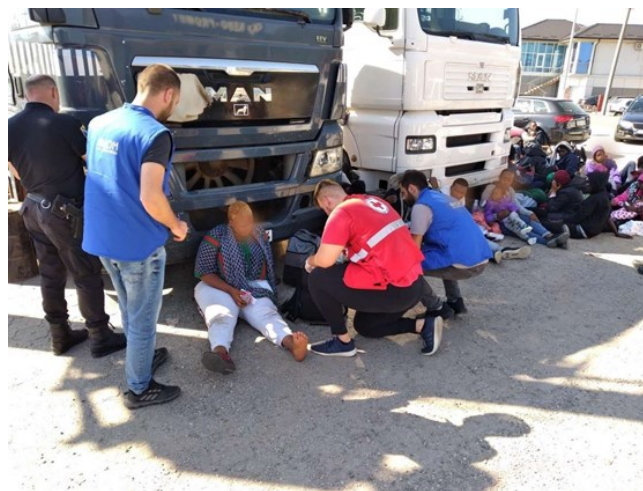
IOM'S MOBILE TEAM AND RED CROSS ASSISTING A FAMILY IN ZVORNİK AREA