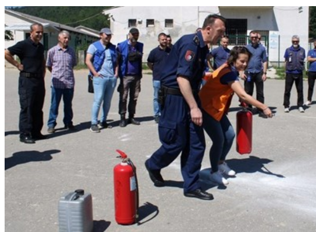
FIREFIGHTING AND PREVENTION BASIC TRAINING FOR TRC BLAŽUJ AND TRC UŠIVAK STAFF.

The exercise was held in four groups so that everyone had a chance to participate in both the theoretical and practical parts of the training.