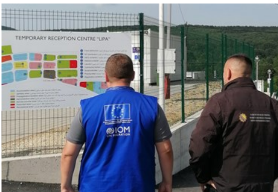
IOM AND THE SFA COORDINATED TO SET UP THE NEW INFO POINTS IN TRC LIPA WHICH PROVIDE USEFUL INFORMATION ABOUT THE CENTRE AND AVAILABLE SERVICES.

In TRC Lipa, IOM, in coordination with the Service for Foreigners' Affairs (SFA) and IOM's Communications Department, has established new Info Points within the centre to provide detailed information on services and activities for migrants available in TRC Lipa.