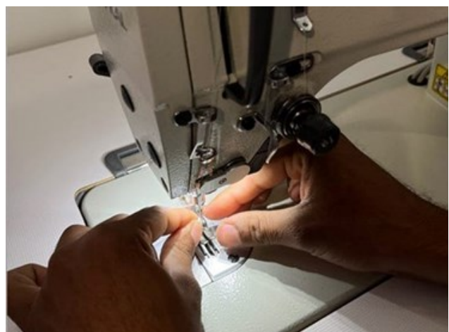
MIGRANTS UPGRADE THEIR SEWING SKILLS IN THE NEW NO NATION FASHION WORKSHOP IN THE CREATIVE CORNER IN TRC LIPA.