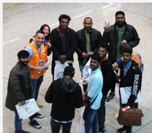
AVRR BENEFICIARIES BEFORE THEIR DEPARTURE TO INDIA.