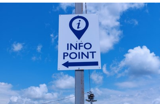
SIGNPOST FOR THE NEW INFO POINT IN TRC LIPA.