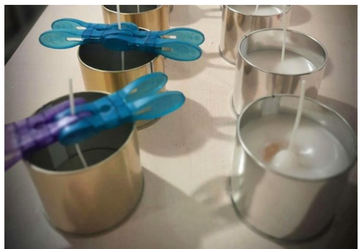
PROCESS OF MAKING HAND-MADE SCENTED CANDLES IN TRC LIPA IS A NEWLY INTRODUCED ACTIVITY WITHIN THE CREATIVE ZONE.