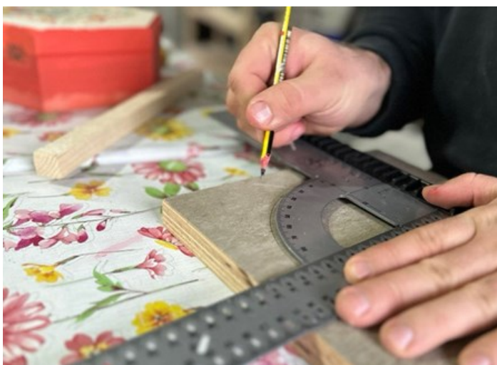
DECOUPAGE PRACTICE WITHIN CREATIVE WORKSHOPS FOR MIGRANTS IN TRC BORIĆI.

In coordination with the Technical Faculty of the University of Bihać, migrants active in TRC Lipa's creative zone had the opportunity to learn how to make hand-made scented candles. Individuals from Cuba, Burundi and Syria joined this workshop and created soaps of different colours, moulds and aromas with scents based on their countries of origins.