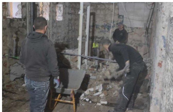
RECONSTRUCTION WORKS ON WASH FACILITIES IN TRC BORIĆ.