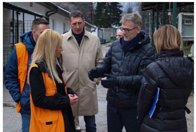
A VISIT OF THE AMBASSADOR OF NORWAY TO BIH OLAV REINERTSEN TO TRC UŠIVAK.

On 19 January, IOM organized an event to highlight the results of Enhancing Social Cohesion in Communities Hosting People on the move, a project funded by the European Union. The 24-months initiative benefitted people on the move and BiH citizens through community grants and improved public infrastructures, notably in the health sector.