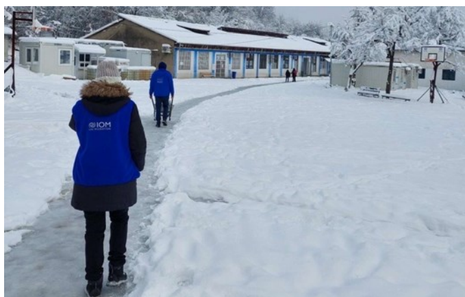
APPLYING SALT ON INTERNAL ROADS IN TRC BLAŽUJ.

IOM has mobile teams that are present at locations outside of TRCs to increase access to information and services for migrants staying outside of formal reception facilities, with the aim to reduce the number of migrants camping or squatting in abandoned buildings. The mobile teams screen for vulnerabilities, provide emergency assistance, and provide transportation services for migrants to TRCs upon request.