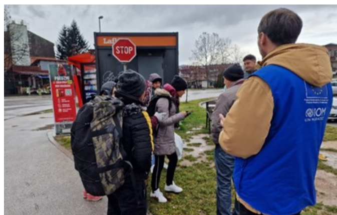
18TH ROUND OF DTM EXERCISE WAS ORGANIZED ON 19 JANUARY.

# Assisted Voluntary Returns in 2022: 128