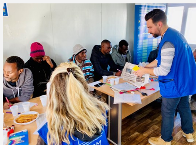
MEDIN AND IOM COLLEAGUES HOLDING A LEGAL INFO SESSION WITH BENEFICIARIES.

Lastly, to understand residents' educational background and interest in trainings and recreational activities, IOM Protection teams have completed more than 1,000 skills assessments since July 2022. These assessments provided key information that contributed towards an increase in migrant participation at the TRCs, as well as an improvement in the quality and efficiency of existing services.