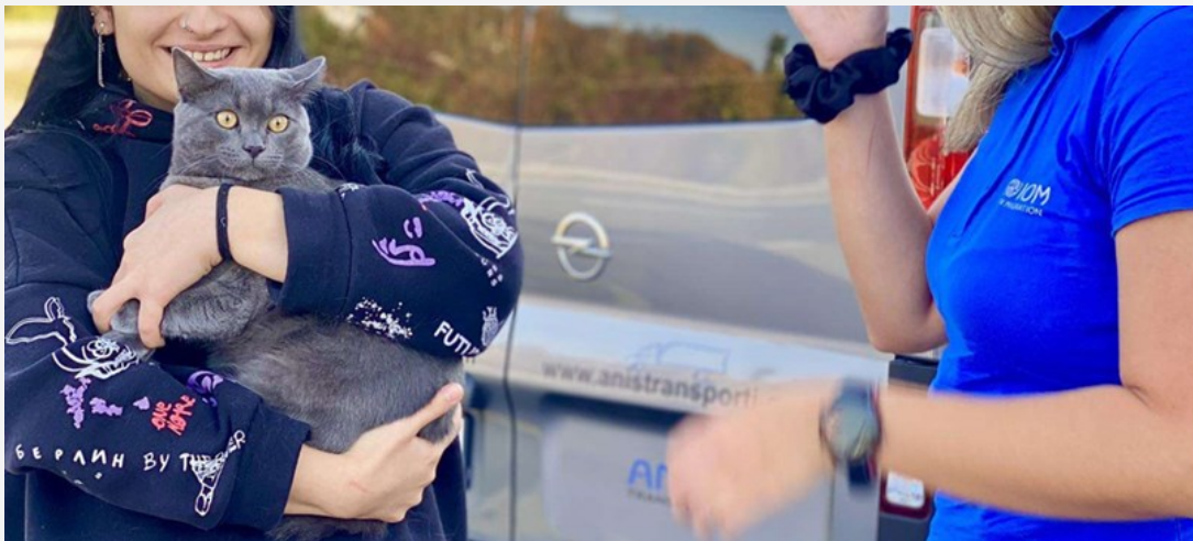
OSCAR, THE FAMILY CAT, SAFELY ARRIVED IN TRC UŠIVAK.

After a few hours of transport, the family was welcomed into TRC Ušivak by the IOM CCCM team. The family and Oscar settled into their accommodation and received information about the assistance available, including food and NFI, water, sanitation and hygiene (WASH), health and protection services as well as social activities. The family shared that bringing along their cat had aided their mental well-being in difficult times with leaving their home and being on the move. In face of the dynamic environment that IOM BiH operates, IOM staff members have excelled at responding to the unique needs of every individual. As such, IOM staff in the centre happily accommodated not only the needs of this family upon their arrival but also those of their beloved cat.