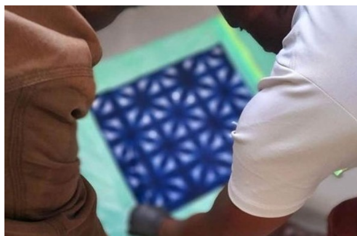
MIGRANTS IN TRC LIPA PRACTICE JAPANESE TEXTILE DYING TECHNIQUE SHIBORI .