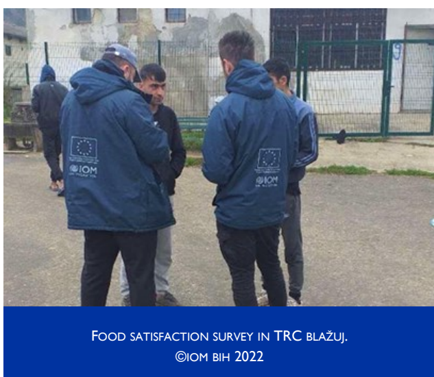
FOOD SATISFACTION SURVEY IN TRC BLAŽUJ.