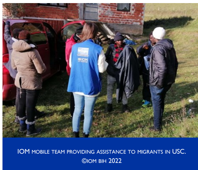
IOM MOBILE TEAM PROVIDING ASSISTANCE TO MIGRANTS IN USC.