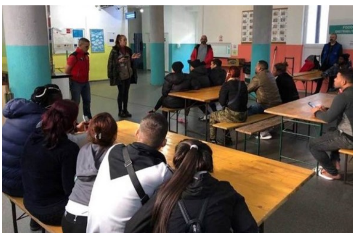
A WORKSHOP „DANGERS IN NATURE AND HOW TO PREVENT THEM“ WAS HELD IN TRC BORIĆI.

# of people reached with information sessions: 766