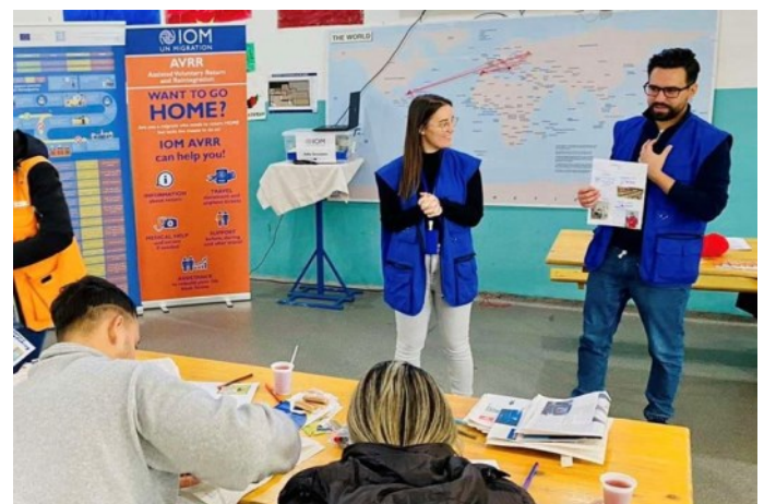
LEGAL INFORMATION SESSION IN TRC BORIĆI.

IOM and local organization Vaša Prava continued to roll out the new legal information sessions in all TRCs in BiH. So far 60 beneficiaries took part in the sessions which included information on the rights and obligations of migrants within the existing legal frameworks, asylum seeking procedures and assisted voluntary return and reintegration (AVRR) services to countries of origin. The purpose of the legal information sessions is also to raise awareness about the risks of irregular migration, prevent misinformation and provide accurate and precise updates on topics which are of interest for beneficiaries.