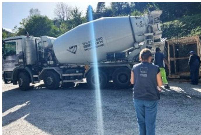
REPAIRATION OF ROAD IN TRC UŠIVAK.