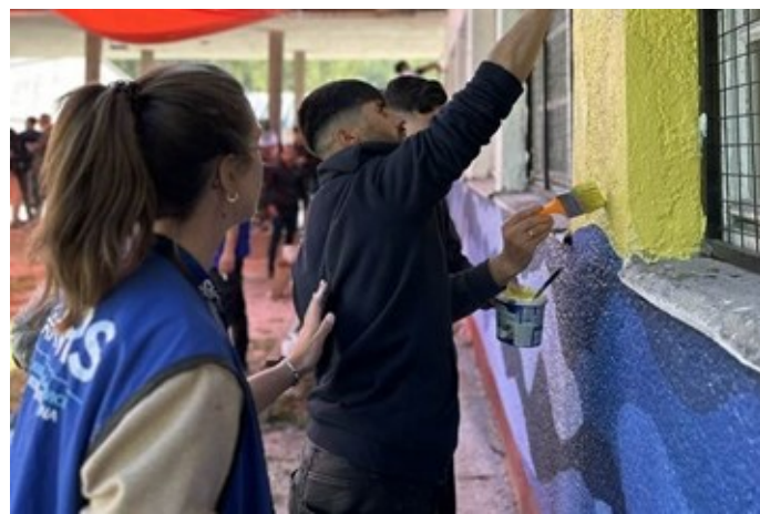
IOM STAFF AND MIGRANT VOLUNTEERS TEAMED UP IN TRC BLAŽUJ FOR CREATIVE MURAL PAINTING IN THE SOCIAL HUB AREA.