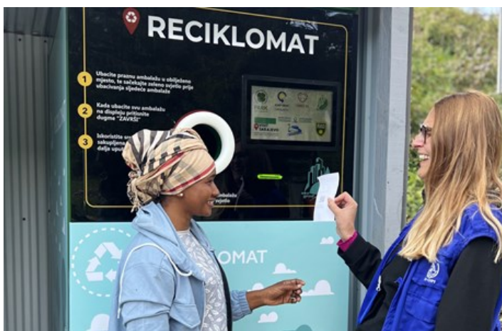
A RECYCLING MACHINE "RECYCLOMAT" IS NOW ALSO IN USE IN TRC UŠIVAK.

# of emergency screenings in TRCs: 2,716