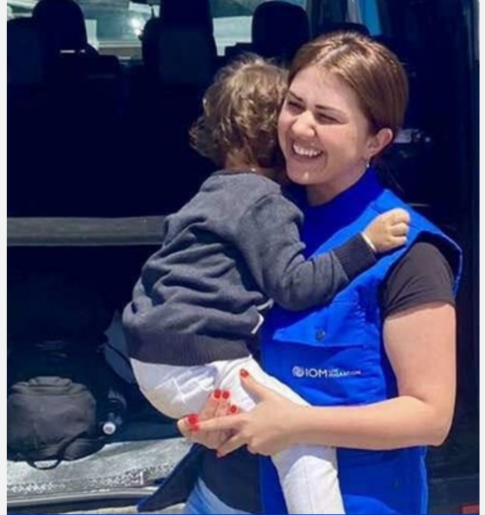
TANJA PROVIDING ASSISTANCE TO A VULNERABLE MIGRANT FAMILY.

On 19 August IOM celebrates World Humanitarian Day and all the persons who work so hard in BiH to uphold the dignity and rights of migrants and other vulnerable groups.