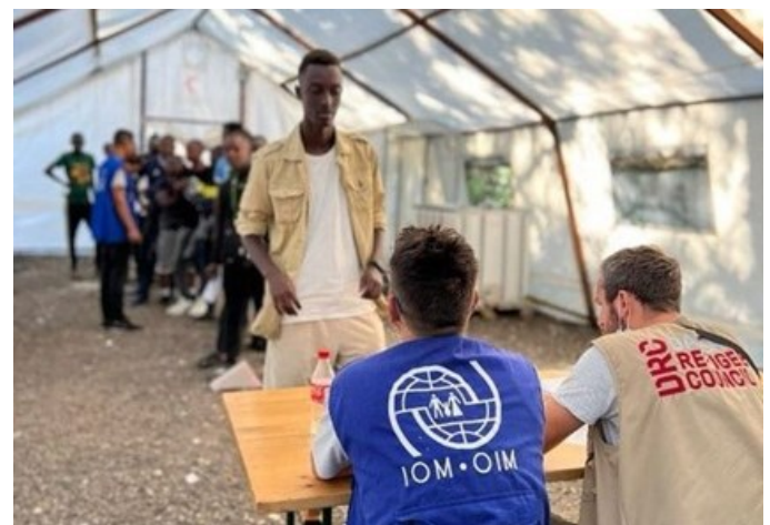
EMERGENCY SCREENING IN TRC BLAŽUJ FOR NEW ARRIVALS.

On 19 August, various events were held for World Humanitarian Day to highlight IOM's dedication to serving vulnerable people in BiH. In TRC Blažuj, an exhibition with pictures of recent accomplishments and positive stories was organized, after which staff and migrants shared food and played music.