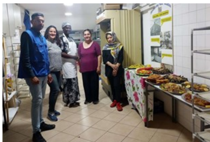
MIGRANT WOMEN FROM TRC UŠIVAK AT THE "OKUSI JABLANICA" EVENT.