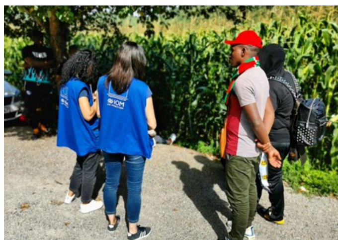
IOM MOBILE TEAM RESPONDING TO A REFERRAL FOR VULNERABLE MIGRANTS IN USC.

IOM's Mobile Team is present in locations outside of TRCs to increase access to information and services, with the aim to reduce the number of migrants camping or squatting in abandoned buildings. The mobile team screens for vulnerabilities, provides emergency assistance, and transports migrants to TRCs upon request.