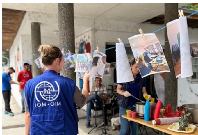
CELEBRATION OF WORLD HUMANITARIAN DAY IN TRC BLAŽUJ.

# of people reached with individual assistance: 87