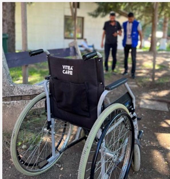
IOM STAFF PROVIDING SUPPORT TO A BENEFICIARY WITH DISABILITY.

As reflected in the accommodations introduced to the Mother and Baby Wash Unit, IOM is committed to the inclusion of persons with disabilities in its humanitarian response. IOM supports the improvement of data collection on disability, the reduction of barriers to ensure more meaningful access to humanitarian services for persons with disabilities and capacity development of staff and partners on disability inclusion, in line with the 2017 Humanitarian Standards and 2019 IASC Guidelines on the Inclusion of Persons with Disabilities in Humanitarian Action.