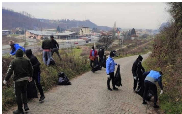
A JOINT MIGRANTS-LOCAL COMMUNITY CLEANING ACTION NEAR TRC BLAŽUJ.