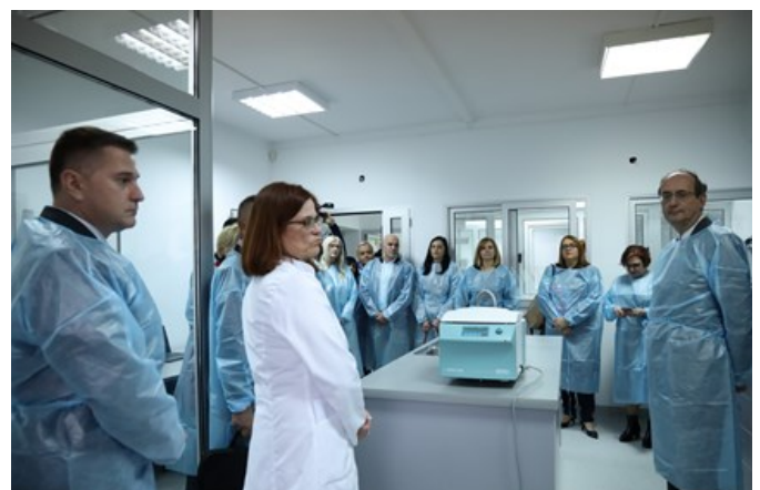
OPENING OF THE LABORATORY FOR MOLECULAR DIAGNOSTICS.

destination are Germany (33%), Italy (31%), France (24%) and Belgium (9%). The report is accessible here