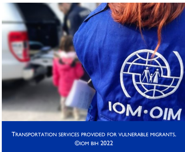
TRANSPORTATION SERVICES PROVIDED FOR VULNERABLE MIGRANTS.

IOM's mobile teams provided 45 transportation services for 102 migrants during the reporting period, 260 information and 15 psychological first aid sessions.