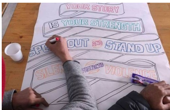
A WORKSHOP WITHIN MARKING 16 DAYS OF ACTIVISM AGAINST GENDER-BASED VIOLENCE IN TRC LIPA.

# of people reached with information sessions: 921