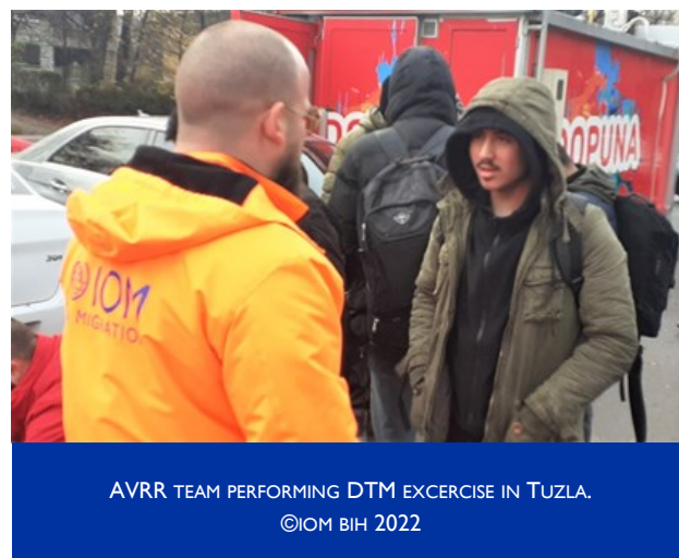
AVRR TEAM PERFORMING DTM EXERCISE IN TUZLA.