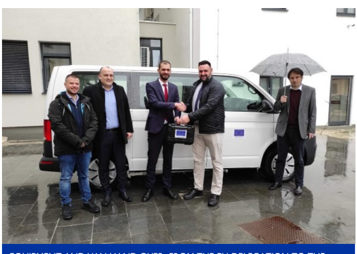
EQUIPMENT AND VAN HAND OVER FROM THE EU DELEGATION TO THE WEST HERZEGOVINA CANTON MINISTRY OF INTERIOR

In TRC Lipa, the SFA is organizing coordination meetings, and gathering monthly updates from partners. The SFA also approached agencies to organize trainings on topics including gender-based violence (GBV), psychological first aid and child safeguarding. The SFA also organized a meeting on mental health and psychosocial support (MHPSS) with IOM, MdM and DRC, to agree on the referral mechanisms for urgent cases. As requested by the SFA, the IOM MPHSS team will ensure a 24/7 monitoring of these cases in the TRC.