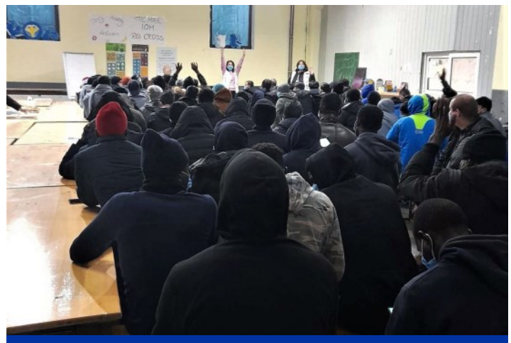
THE FIRST WORKSHOP ON RAISING AWARENESS ABOUT THE PSYCHOACTIVE SUBSTANCES ABUSE ORGANIZED IN TRC MIRAL