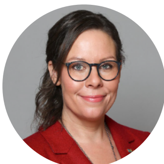
Maria Malmer Stenergard Minister for Migration of Sweden (video message)