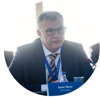
Samir Rizvo Assistant Minister to the Minister of Security of Bosnia and Herzegovina