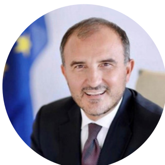
Luigi Soreca Ambassador, Special Envoy for External Aspects of Migration, European External Action Service