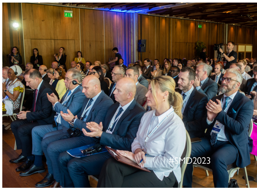
Maria Malmer Stenergard Minister of Justice of Sweden (video message)

"Managing migration is a common challenge that the European Union and the Western Balkans must address together in close partnership."