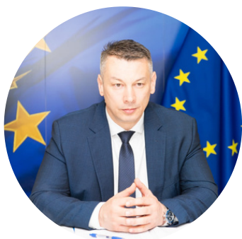
Nenad Nešić Minister of Security of Bosnia and Herzegovina