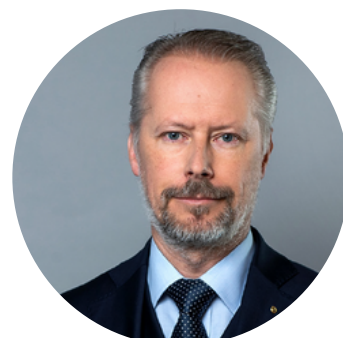
Anders Hall State Secretary to the Minister for Migration of Sweden