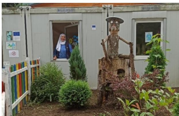
THE NEWLY CLEANED MOTHER BABY WASH UNIT GARDEN IN TRC UŠIVAK