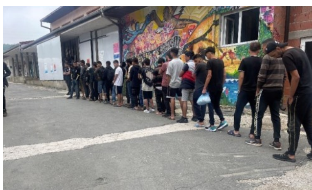
FOOD DISTRIBUTION ACTIVITIES IN TRC BLAŽUJ

# Assisted Voluntary Returns in 2023: 43