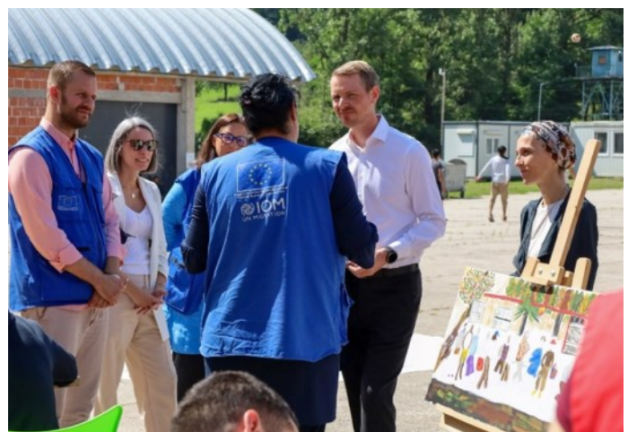
REPRESENTATIVES OF THE KINGDOM OF NORWAY VISIT IN TRC BLAŽUJ