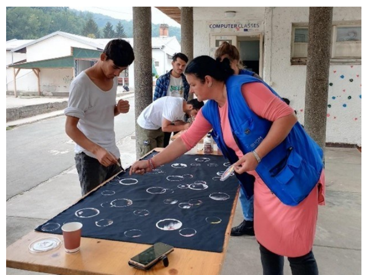
CREATIVE PAINTING ACTIVITIES ©IOM 2023