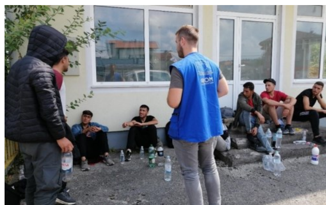
IOM MOBILE TEAMS PROVIDING INFORMATION TO MIGRANTS OUTSIDE OF TRCs