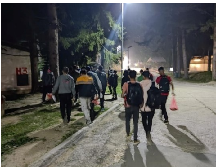
PROVISION OF ACCOMMODATION TO NEW BENEFICIARIES DURING THE NIGHT SHIFT

# of persons with protection risks and needs: 286