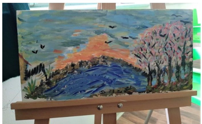
PAINTING MADE BY A BENEFICIARY AT AN ART WORKSHOP ORGANIZED BY IOM.

In TRC Ušivak, IOM continues to organize regular Community Council meetings to ensure engagement and participation of beneficiaries in the center. As a result of feedback received during a recent meeting, IOM's camp coordination and camp management (CCCM) team added yoga as one of the activities offered in the center. IOM organized the acrylic painting workshop in TRC Ušivak on 27 July, with 12 migrants (9 women and 4 men) taking part.