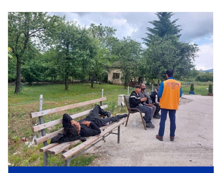
AVRR INFORMATION SHARING FOR MIGRANTS OUTSIDE OF RECEPTION CENTRES IN SARAJEVO CANTON.

# Assisted Voluntary Returns since 2018: 1,360 # Assisted Voluntary Returns in 2023: 36