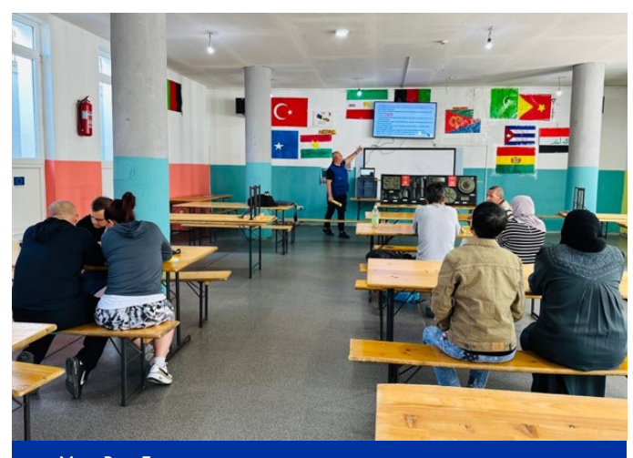
Mine Risk Education sessions are implemented for migrants in reception centres by IOM to increase their knowledge on mine related risks in BiH. TRC Borići, June 2023.