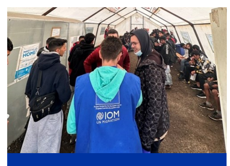
Newly arrived migrants in TRC Blažuj during the registration procedure