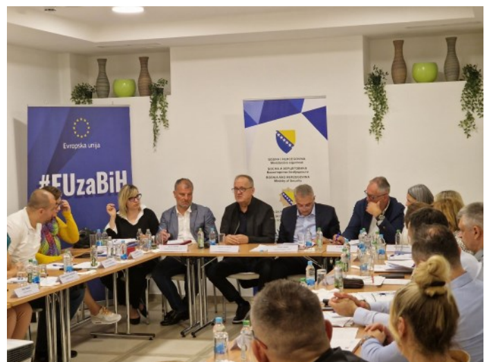
MEETING IN TREBINJE ON THE TRANSITION PLAN FOR A STATE-LED MIGRATION RESPONSE

IOM, in cooperation with UNICEF, organized a study visit for BiH social protection and migration management institutions representatives to Italy. The aim of the visit was to strengthen the capacity of BiH institutions which are directly involved in the protection of unaccompanied or separated children (UASCs). The exchange of experiences with relevant institutions in Italy enabled officials from BiH to strengthen their understanding of good practices in terms of legislation, accommodation capacity management, protection measures and integration practices relevant to UASCs.