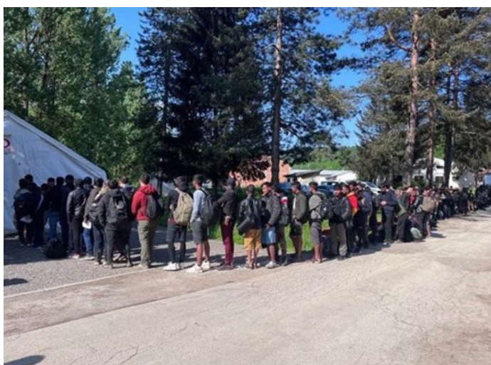
MIGRANTS IN TRC BLAŽUJ WAITING FOR THE REGISTRATION PROCESS TO ACCESS THE SERVICES IN THE CENTRE.

# of individual assistance: 175 # of persons reached through information sessions: 1,130