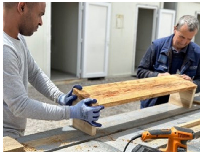
WOODWORKING WORKSHOP IN TRC BORIĆI.