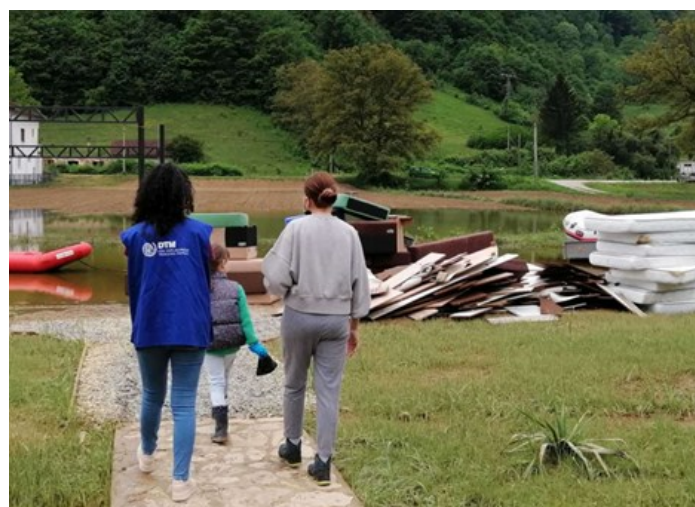
IOM'S MOBILE TEAMS COLLECTING INFORMATION IN FLOODED AREAS IN BIHAĆ FOR THE NEEDS ASSESSMENT.