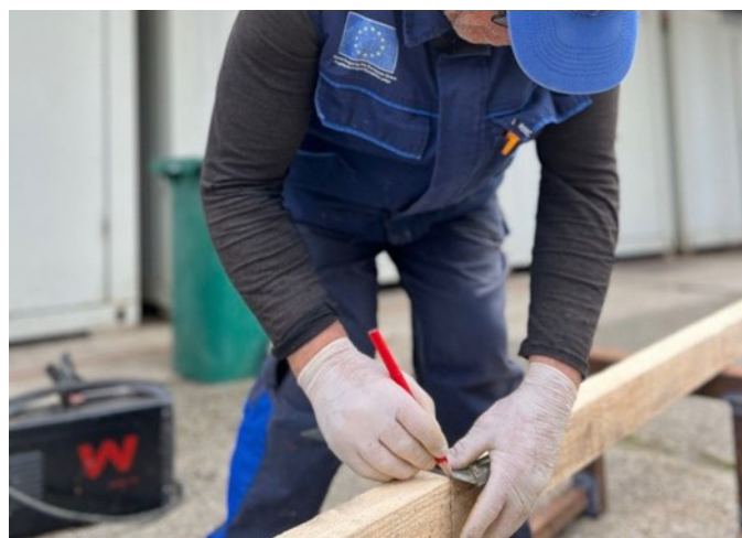
CONSTRUCTION OF NEW BENCHES IN TRC UŠIVAK