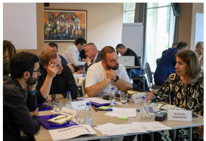
A RESEARCH AND DATA CAPACITY BUILDING TRAINING FOR WESTERN BALKAN PARTNERS.

On 9 May, the SFA and IOM accompanied the Ambassador of Norway to BiH, Olav Reinertsen, during a visit to Temporary Reception Centre (TRC) Blažuj. The visit showcased the results of the IOM-led regional project Addressing Mixed Migration Flows in the Western Balkans, funded by the Norwegian Ministry of Foreign Affairs. Through this project, IOM provides protection-sensitive assistance to migrants in transit, ensures access to assisted voluntary return and reintegration, and collects data on mixed migration flows in BiH and the region to inform effective responses and foster regional cooperation.