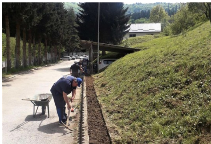
SPRING MAINTENANCE ACTIVITIES TOOK OFF IN ALL RECEPTION CENTRES. IN TRC UŠIVAK, IOM PREPARED GROUND FOR PLANTING.

CCCM teams in TRC Blažuj and TRC Ušivak coordinated the transfer of 86 unaccompanied or separated children to TRC Ušivak. The admission process was carried out in coordination with the SFA and World Vision.