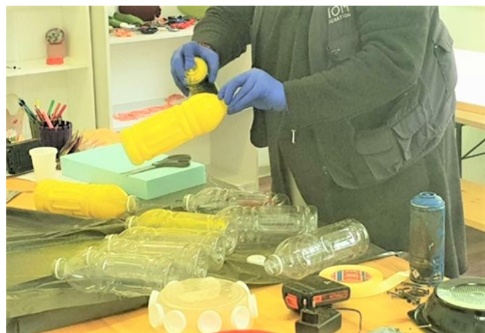
RECYCLING WORKSHOP FOR MIGRANTS IN TRC BLAŽUJ.

# of persons with protection risks and needs: 142