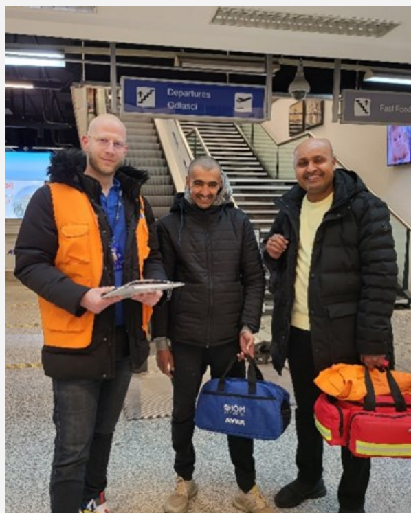
MOHAMED SAFELY RETURNED TO HIS COUNTRY OF ORIGIN.

*The name has been changed to protect privacy