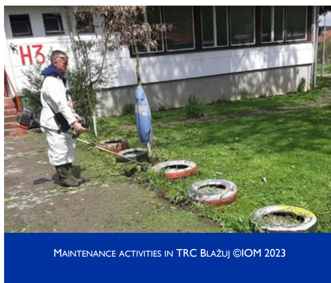
MAINTENANCE ACTIVITIES IN TRC BLAŽUJ