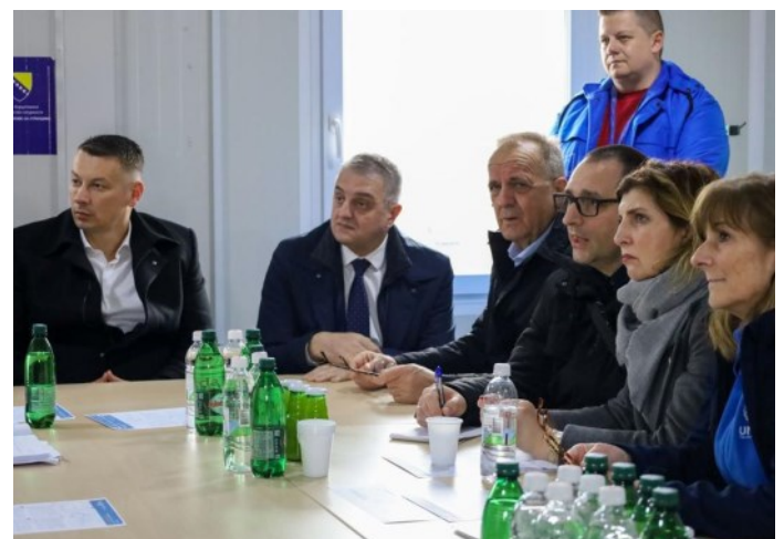
OFFICIAL VISIT TO THE TEMPORARY RECEPTION CENTRE (TRC) LIPA

From 24-27 April, IOM in cooperation with the SFA organized the training "Capacity building on protection-sensitive approaches to working with vulnerable categories", with participation of both IOM mobile teams and SFA officials involved in the mixed migration response. The main goal of the training was to strengthen cooperation between the SFA and IOM in the provision of information and referrals to vulnerable migrants.