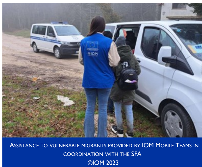
ASSISTANCE TO VULNERABLE MIGRANTS PROVIDED BY IOM MOBILE TEAMS IN COORDINATION WITH THE SFA