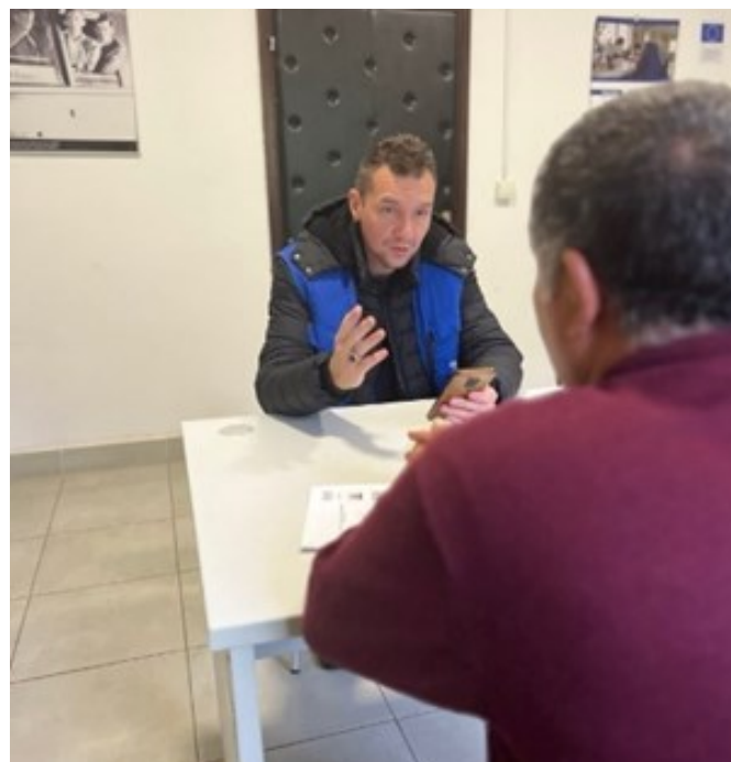
CONDUCT OF A SURVEY ON THE SATISFACTION OF BENEFICIARIES REGARDING THE SERVICES PROVIDED BY IOM