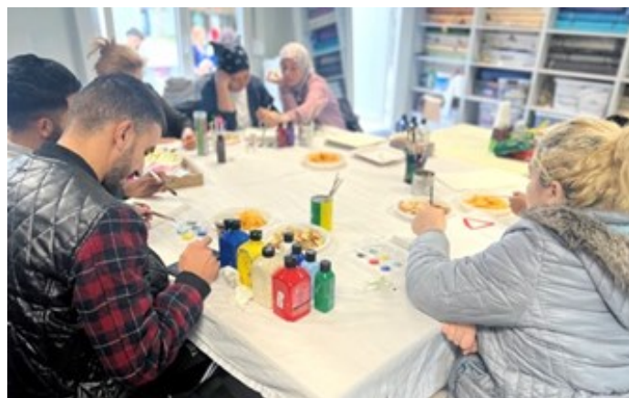
CREATIVE WORKSHOP IN TRC UŠIVAK.