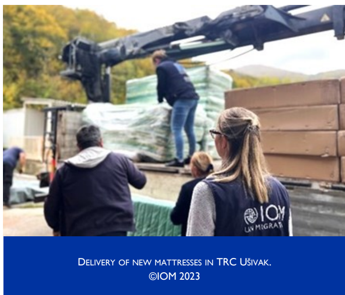
DELIVERY OF NEW MATTRESSES IN TRC UŠIVAK.