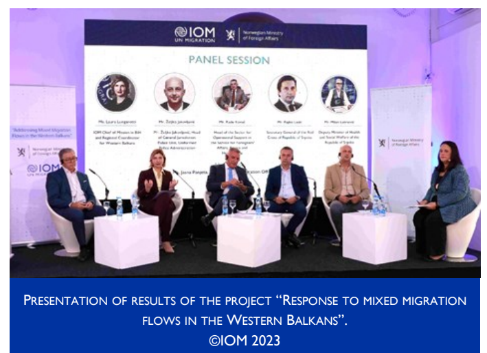
PRESENTATION OF RESULTS OF THE PROJECT "RESPONSE TO MIXED MIGRATION FLOWS IN THE WESTERN BALKANS".

aggregating data on the profiles, experiences, needs and intentions of over 1,000 migrants surveyed in the region in the summer of 2023.