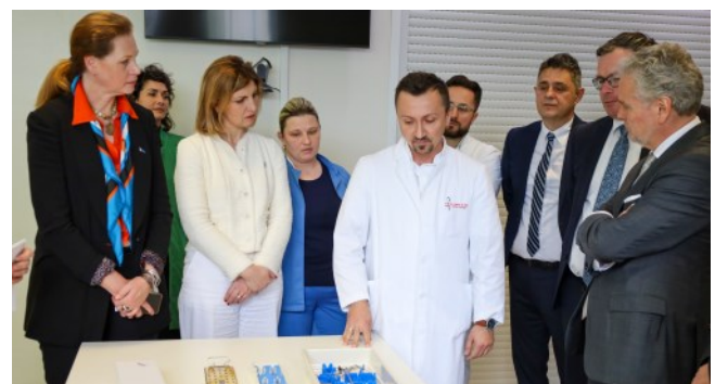
DONATION OF A CYSTOSCOPE FOR THE CANTONAL HOSPITAL "DR. IRFAN LJUBIJANKIĆ" IN BIHAĆ

social welfare institutions from Bosnia and Herzegovina, Montenegro, and Serbia on "Effective Inter-Institutional Cooperation to Combat Human Trafficking and Migrant Smuggling". Frontline practitioners shared knowledge and enhanced skills for the investigation of trafficking and smuggling cases, and promotion of victim-centered and child-sensitive approaches during the process.