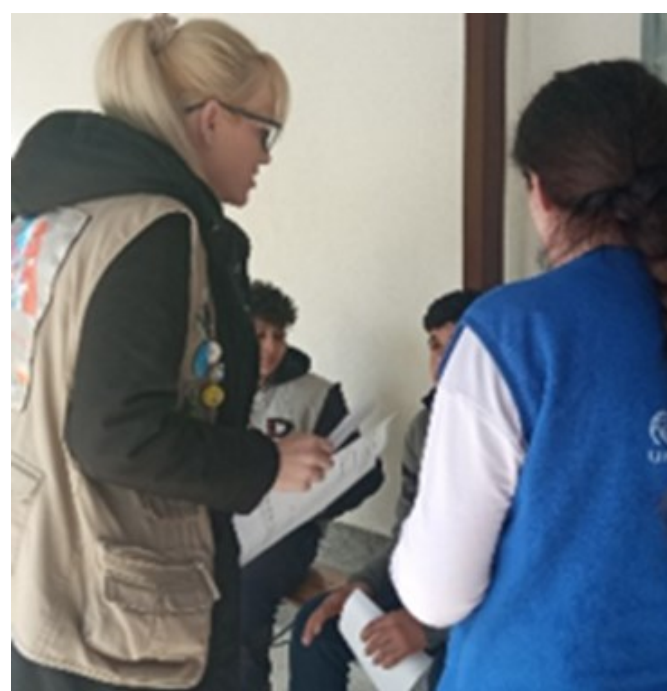
COORDINATION OF TRANSFER OF UASC FROM TRC BLAŽUJ TO TRC UŠIVAK TO ENABLE PROTECTION-SENSITIVE RECEPTION.

In all TRCs in BiH, 31 skills assessment questionnaires were conducted during the reporting period.