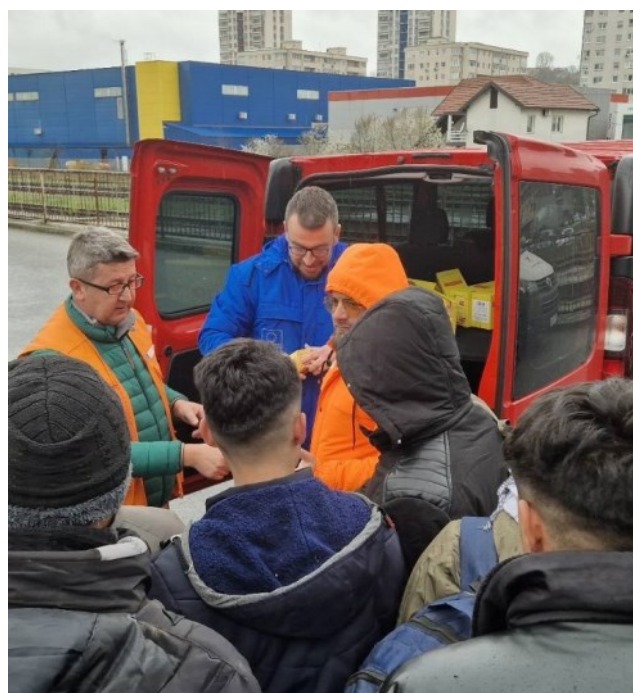
IOM AVRR TEAM SHARING INFORMATION IN OUTREACH IN TUZLA.