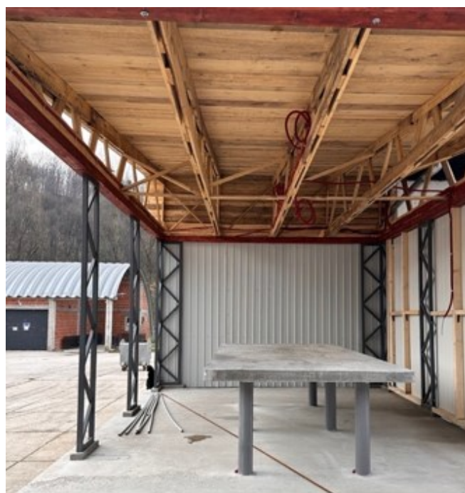
A GAZEBO UNDER CONSTRUCTION IN TRC BLAŽUJ.

IOM's maintenance and cleaning team inspects all TRC installations daily, with two cleanings per day, weekly disinfection, disinfestation, and derating measures, and regular repairs on shelters and sanitary installations. IOM maintenance staff carried out finishing works on the newly constructed gazebo in TRC Blažuj. This included the construction of a concrete table, which will be covered with ceramic tiles and completed with benches.