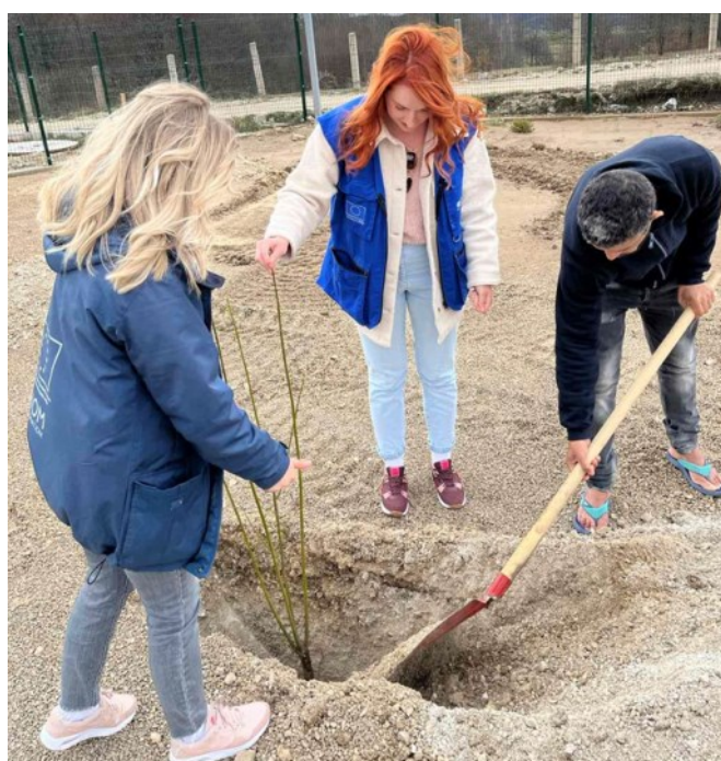
200 TREE SEEDLINGS WERE PLANTED IN TRC LIPA TO MARK APPROACHING EARTH DAY.

# of referrals to specialized and non-specialized services: 359