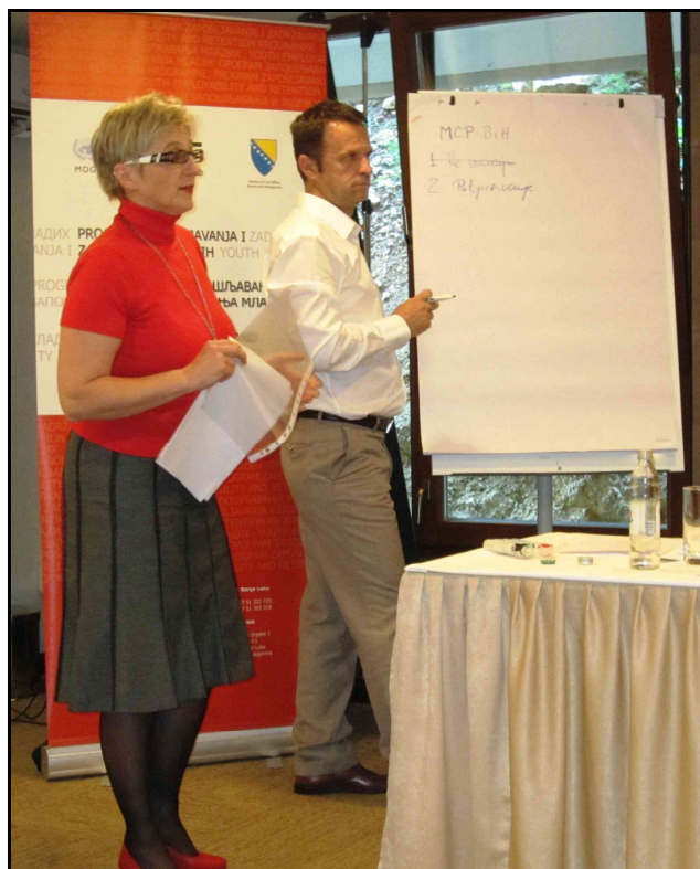
Participants at a recent meeting of the Youth Labour Migration Working Group. During the meeting, a mapping exercise was completed in order to identify institutional responsibilities in the process of legal labour migration.

As part of the project, IOM will design and implement a pilot circular/temporary migration (TCLM) scheme for both skilled and unskilled youth. IOM will work through its worldwide network of missions to identify work and internship opportunities abroad and match foreign labour demand with local labour supply. Opportunities in interested destination countries for seasonal employment primarily in the agriculture or tourism sectors will be identified. In addition, young Bosnians will be linked with internship opportunities abroad that will allow them to gain skills and experience in their chosen field.