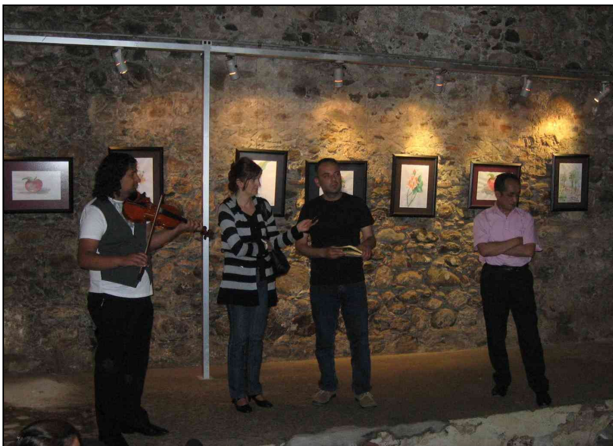
Roma youth reading poetry accompanied by the sound of a violin playing Roma ballads. "A place under the sun" poetry book