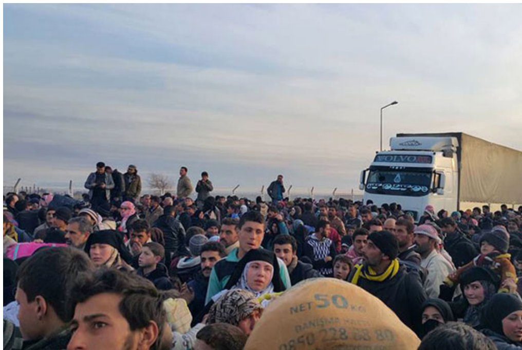
Syrians fleeing Aleppo arrive at the Turkish border.