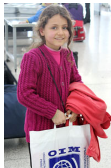
A Syrian refugee child leaves Turkey for resettlement in Europe (File photo).

Now read on | Share on Twitter Facebook LinkedIn